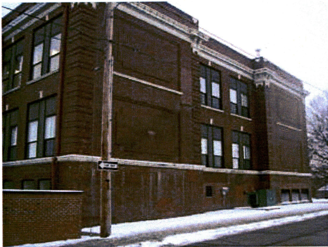
North elevation photo: