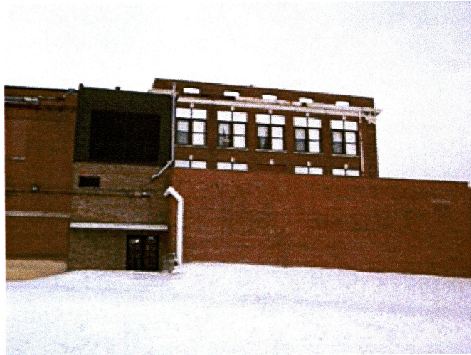
South elevation photo: