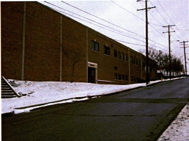
East elevation photo: