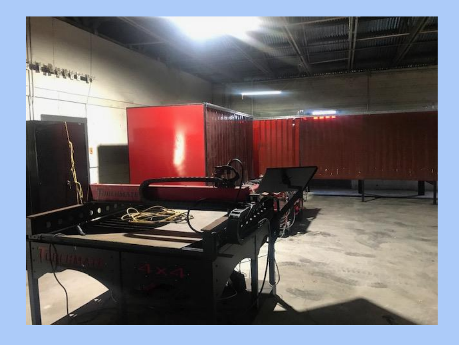
Norrell Building - new location for Dual Credit Welding in spring 2020.