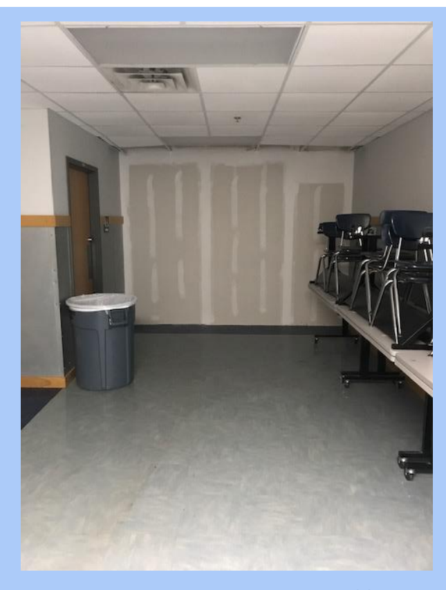
Temporary wall to block off main building from CTE building for the purpose of construction