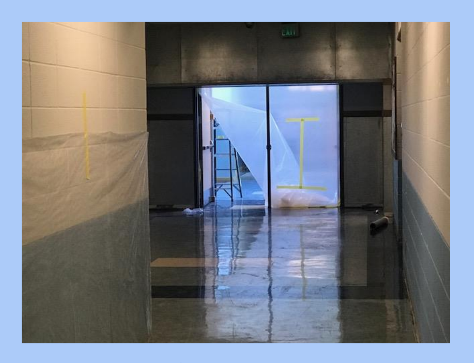
Prep work for asbestos abatement over Christmas holidays at the CTE building