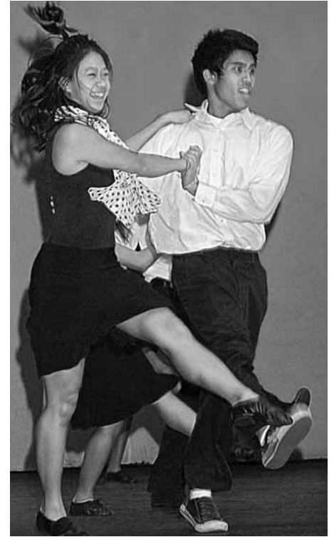
DANCE SPECTRUM — These students from the California Academy of Mathematics and Science were among nearly 200 dancers participating in the annual districtwide Dance Spectrum recently at Poly High School.

Among the programs that Hill highlighted in its application was the school's Safe and Civil Schools effort, a program that has helped to improve student behavior at dozens of schools.