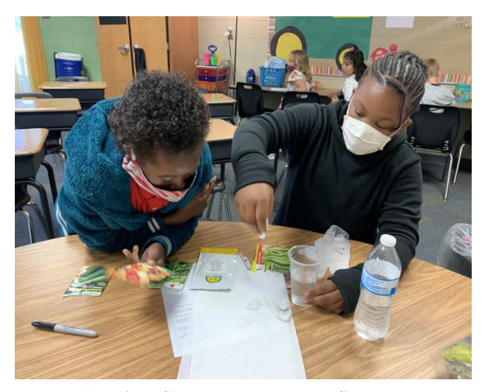
Appling County Elementary School

Input on the use of Title I funds to support family engagement programs may also be provided through the annual district survey. The survey will contain questions related to the family engagement budget and school staff training for parents to provide their comments.