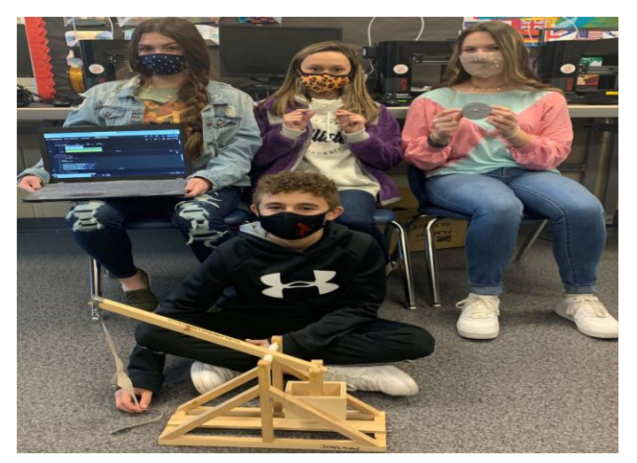
Escuela Intermedia del Condado de Appling