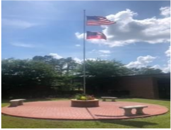
Fourth District Elementary School