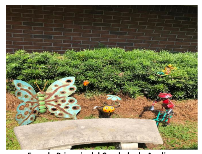
Escuela Primaria del Condado de Appling

Este año, la FEC proporcionará asistencia técnica y apoyo a todas las escuelas del Título I para garantizar que se cumplan con los requisitos de participación familiar y que se implementen estrategias y actividades de participación familiar. Las escuelas del Título I recibirán notificaciones y recursos del distrito y de la FEC para ayudarlas a mejorar y fortalecer la participación de la familia. Además de la comunicación frecuente y las visitas escolares, la FEC celebra reuniones trimestrales y capacitaciones con los FEC de sus escuelas de Título I para revisar los planes y actividades de participación familiar. Después, la FECS escolar capacitará a los administradores y al personal para mejorar y fortalecer la participación de la familia en sus respectivas escuelas.