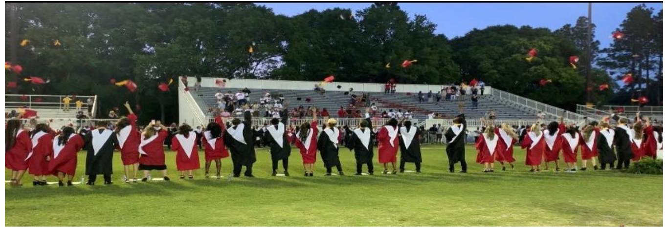
Escuela Secundaria del Condado de Appling