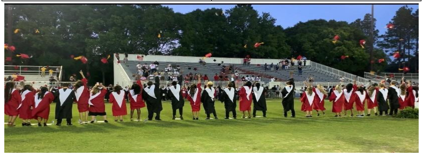
Appling County High School