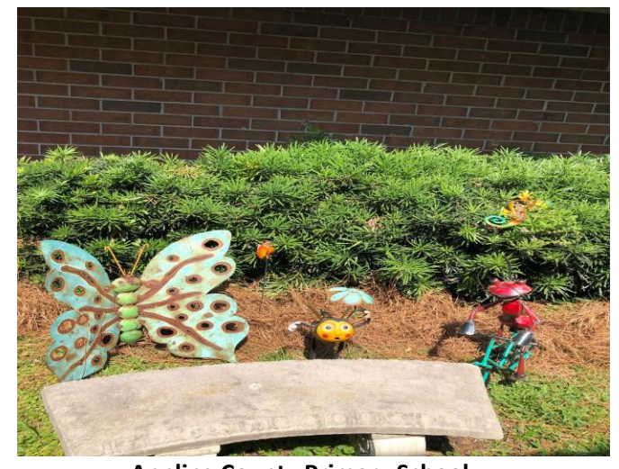
Appling County Primary School

This year, the FEC will provide technical assistance and support to all Title I schools to ensure family engagement requirements are being satisfied and that family engagement strategies and activities are being implemented. Title I schools will receive notifications and resources from the district and the FEC to help them improve and strengthen family engagement. In addition to frequent communication and school visits, the FEC will hold quarterly meetings and trainings with its Title I schools' FECs to review family engagement plans and activities. Subsequently, school FECs will train administrators and staff to improve and strengthen family engagement in their respective schools.