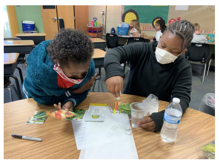
Escuela Primaria del Condado de Appling

Los aportes sobre el uso de los fondos del Título I para apoyar los programas de participación familiar también se pueden proporcionar a través de la encuesta anual del distrito. La encuesta contendrá preguntas relacionadas con el presupuesto de participación familiar y la capacitación del personal escolar para que los padres proporcionen sus comentarios.