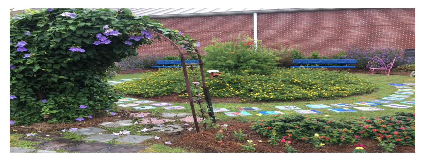
Altamaha Elementary School

Revised May 31, 2022 249 Blackshear Highway Baxley, GA 31513 https://www.appling.k12.ga.us/ 912.367.8600