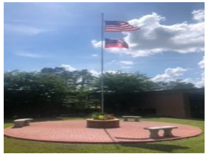
Escuela Primaria del Cuarto Distrito