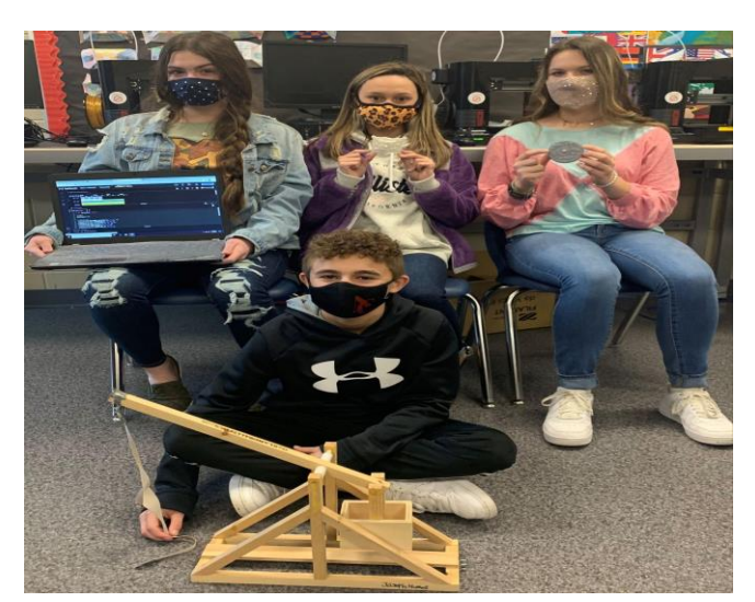
Appling County Middle School