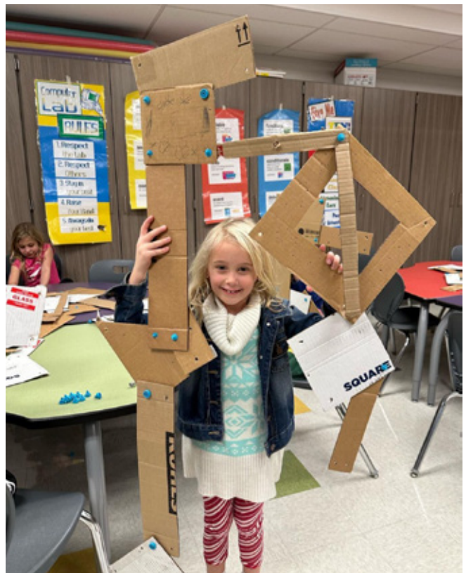
A Kerr Elementary School kindergartner shows off her Makedo cardboard creation. In addition to encouraging upcycling, Makedo creations promote next-generation curriculum concepts such as engineering and design.

Through the initiative, STEM teachers at the elementary level will receive professional development sessions in next-generation concepts such as engineering design theory, systems thinking, and sensemaking, all aimed at creating a cohort of educators proficient in the effective facilitation of STEM learning ahead of the rollout of new science education standards in Pennsylvania. Professional development sessions will be conducted by