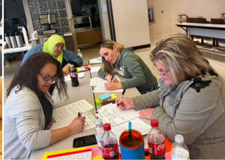
The first cohort of STEM A.C.E.S. educators works on a professional development activity. The first professional development session of the initiative was led by the Consortium for Public Education and the Fox Chapel Area School District.