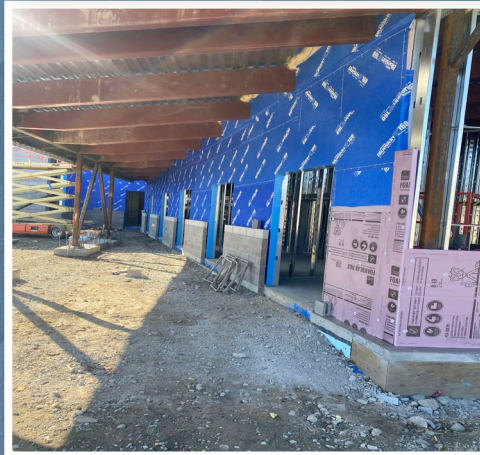
Admin Area Brick Veneer