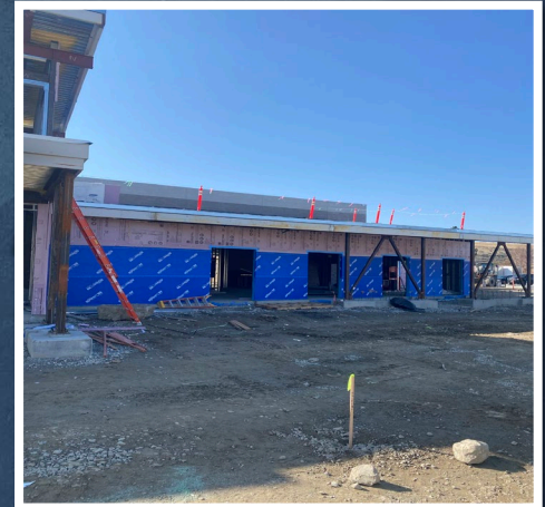
Admin Area Exterior