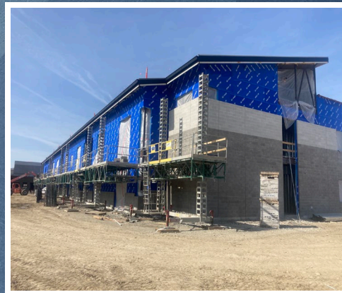
East & South Elevation