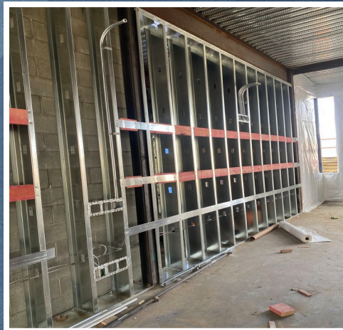
L1 Backing Ongoing