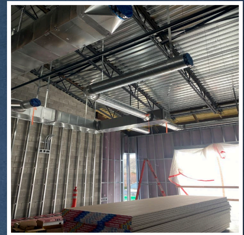
L2 HVAC Install