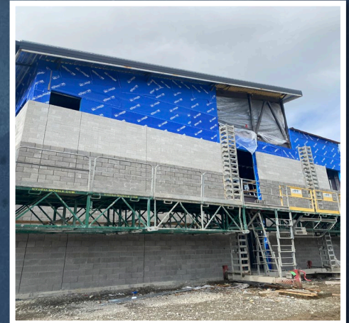
Gridline J Brick Veneer