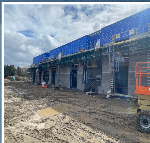
Northside Brick Veneer