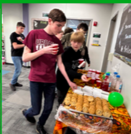
President's Day items gifted to the 2nd Grade