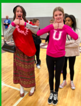
1st Place at the House Minute-to-Win-It assembly

We're looking forward to great things from House Five Points during the 4th quarter and can't wait to see the final standings for the House Cup at the end of the year!