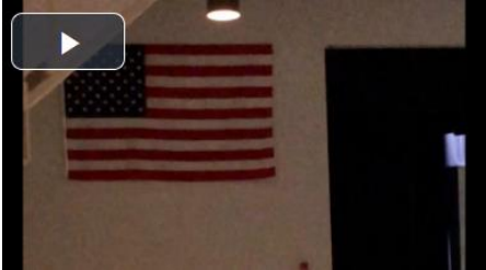
DAHS First Day of School