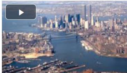
9/11 Tribute Video