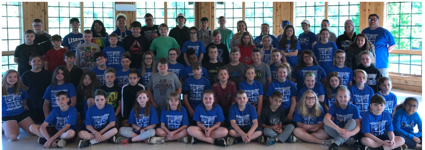
Photo Above: 5th grade students take a second out of their day at Camp Kon-O-Kwee—Spencer for a photo opp.

Photos Above: Students at McKinley Elementary listened to music from Elec as well as a motivational speech. Teachers on the right hand side are doing activities that are aligned with their professional development from Nasa on May 2nd.