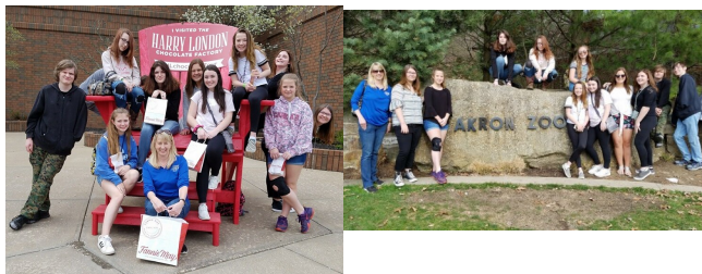
Photos Above: The 8th Grade Science Club at Harry London Chocolate Factory and the Akron Zoon April 17th.