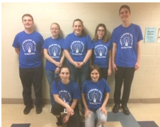
Photo Above: JV Academic Challenge Team for our competition on Thursday, March 14, 2019