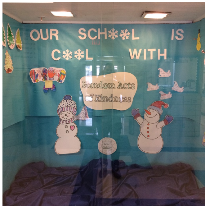
Photo Above: During the month of January, McKinley Elementary will be promoting positive behavior and looking for Random Acts of Kindness. Students names and acts will be displayed in the lobby. Discuss the importance of positive behaviors with your students and help us promote this in our school

Thank you to all of the parents and staff that have joined us and gotten involved this year. Together we can all accomplish so many things. If you are interested in getting involved, our next meeting will be February 7 th at 3:30 pm in the McKinley Elementary Library. We would love to see you there.