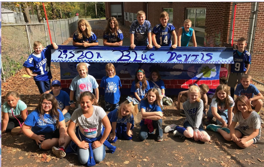
Photo Above : Students at McKinley Elementary helped put a design that is on one of the ODOT Snow Plows