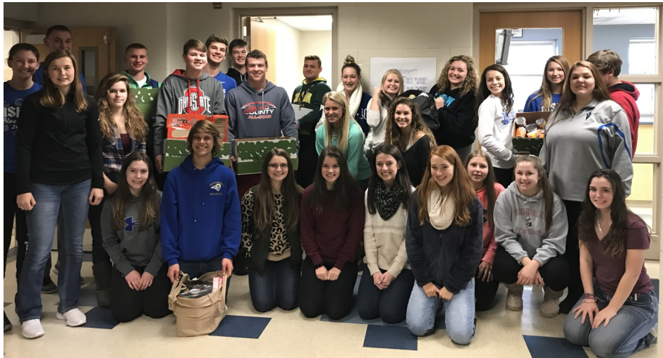
Photo Above: the High School Student Council they ran a food drive during the last week of October for Thanksgiving. All the food items were donated to Food Pantry at the Community Action Agency.