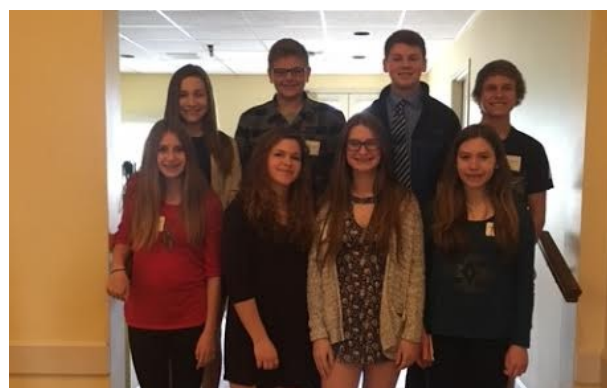
Photos Above: 8th Grade Jr. High Student Senate Members take a second out of their day at the countywide Leadership Summit for a picture.