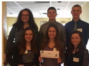
Photo to the Right: Student Council members at the Leadership Summit

The 8th Grade Science Club recently walked dogs at the Columbiana County Dog pound. Volunteers are always welcome to help walk dogs. Also, there are many great dogs up for adoption if you are looking for a new family pet. The students then took a field trip to the Youngstown State Planetarium.