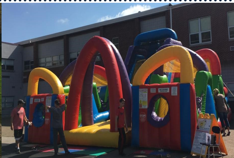
Photo Above: A bounce house was provided for the PTO Carnival, that was held on May 13th at McKinley Elementary.