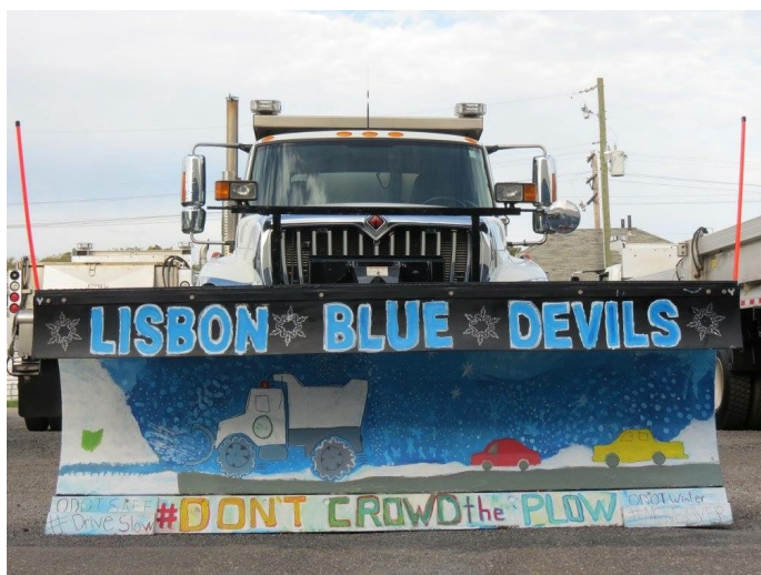
Photo Above: This picture and the picture to the side of this one are trucks that were painted by McKinley Elementary students and this year the theme by ODOT was "Don't Crowd the Plow"