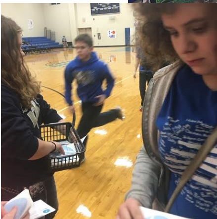
Photo to the left: More students participating as part of the Junior High Student Senate and High School Student Council