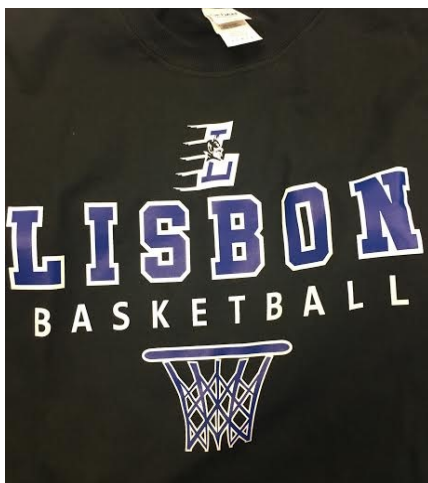
Photo to the right: Students created this shirt for students to buy and wear to games. The proceeds will go towards their Leadership Summit Project