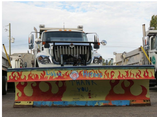
Photo Above: This is the other truck painted by McKinley students for ODOT when they plow these are the logos that are displayed. Several Schools Participated in this project.

community to enhance public awareness, promote safety, and foster greater appreciation of both ODOT and the school's Visual Arts program.