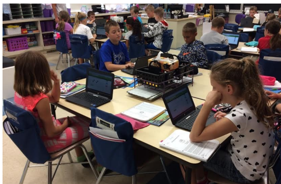
Photo Above: McKinley Elementary students are using technology to take advantage of digital curriculum on their chrome books