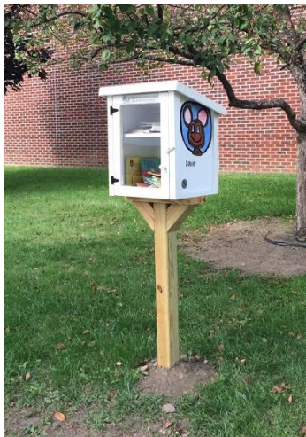
Photo Above: McKinley Elementary's Little Library where students can get books and also place books in to allow students the opportunity to read more.

Student Senate representatives collect recycling from classrooms every week and keep the grounds around the school neat and clean. We will be participating in the Lisbon Christmas parade and conducting a food drive during the holiday season.