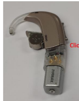
Step 4: Push the audioshoe in until it clicks into place.