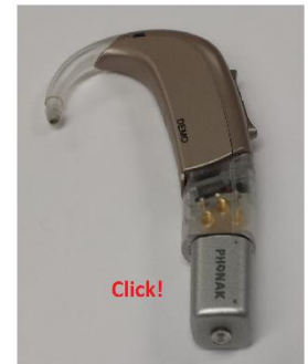
Step 5: Close the battery door and make sure you hear another click.

In the morning, put the audioshoe/receiver on the hearing aid.