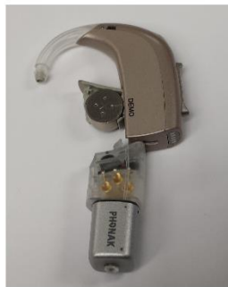
Step 3: Line up the notch on the audioshoe with the track on the hearing aid.