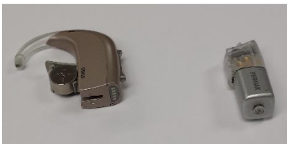
Step 2: Open the Battery Door