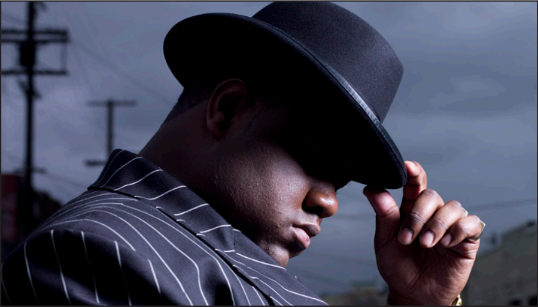
R&B Legend Biggie Smalls rocks a hat

boy screamed some profanities and was kicked out. As he walked out, I just felt as if I should cover my heart and say “God bless America.” Someone was finally arguing for the important things in life. How cruel and unusual is it that the student body should be expected to keep the top of their head uncovered for 7 hours a day? Let me tell you, the genocide in Darfur is a walk in the park compared to the dress codes here. It’s about time we get our priorities in order, Fight to keep your hats; it’s as important as fighting to keep your lives.