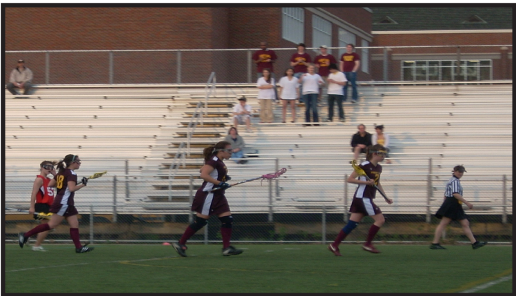
FLHS girls lacrosse team faces off.