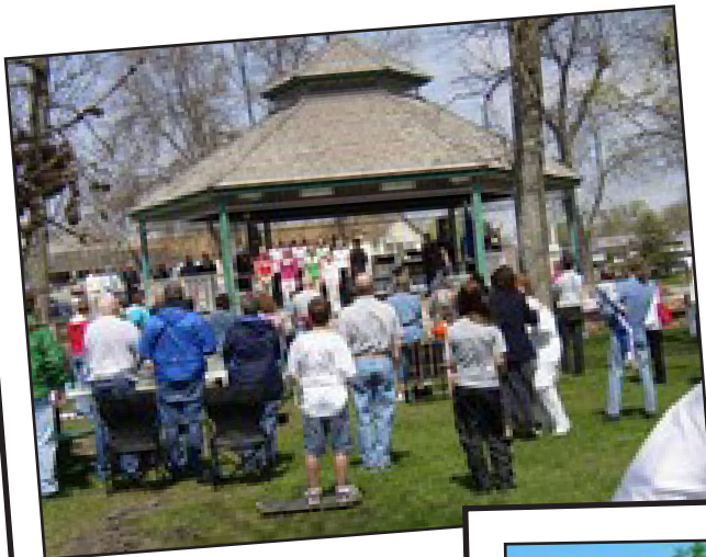
Gazebo at Lakeside Memorial Park