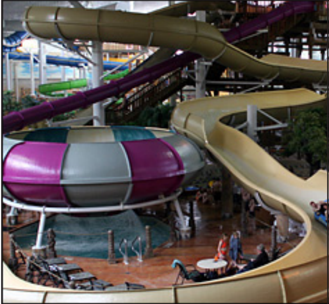
Kalahari Indoor Water Park at Wisconsin Dells.

Chula Vista Resort: This water park focuses greatly on living your life in luxury. It has 6 restaurants, the Spa del Sol and an 18-hole golf course. If you don't want to just hang out, you can get active by hanging out in their water park. The Chula Vista Resort has over 200,000 sq. ft. of water space and over 26 water slides stretching more than 1.5 miles in length. Some of its other features include the world's largest indoor water coaster, Rio Rapid Action River, Croc Roc water walk, and several hot tubs. It