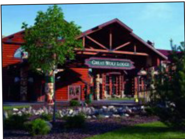
One of the many water parks in Wisconsin Dells