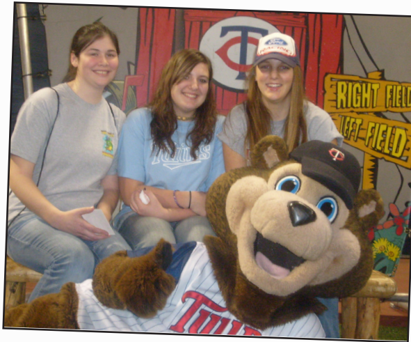
FLHS sophomores pose with mascot T.C. at a recent Twins game