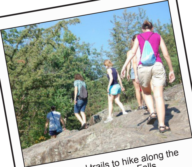
One of several trails to hike along the glacier potholes in Taylors Falls