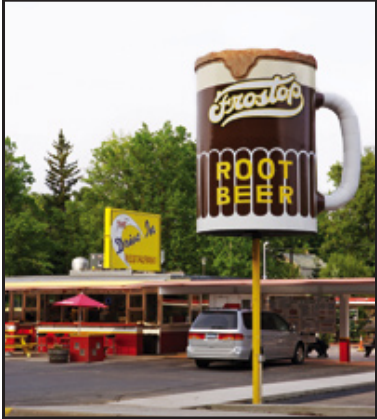
The Drive In Restaurant

pass costs $25, and if you feel like walking a bit more, park anywhere in town for free.