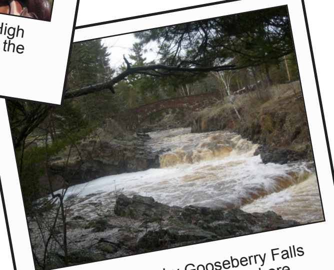
Rushing stream by Gooseberry Falls near Duluth, along the north shore