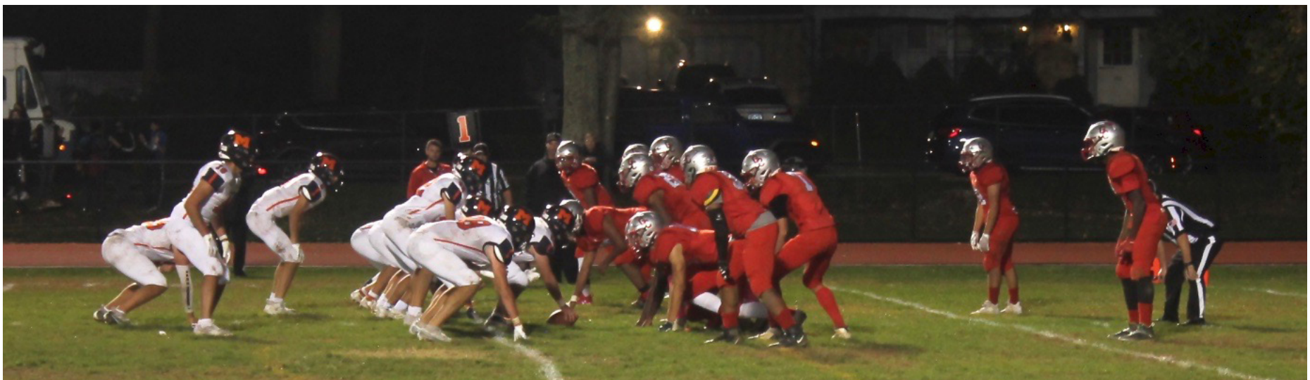
GC Defense moments before the snap

Well as they say, there's always next year.