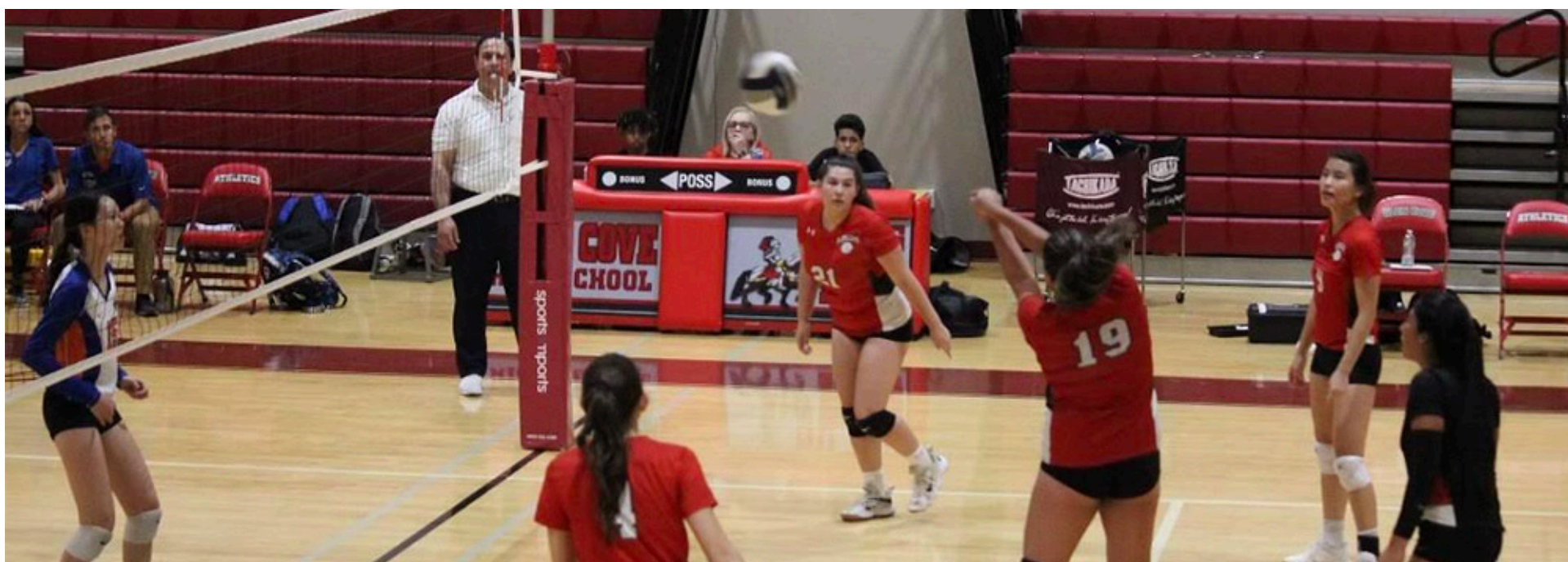
GC Varsity sets up winning shot