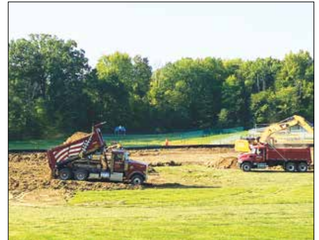
Images of the new baseball field being constructed.

I wish you a great fall, and look forward to updating you in the winter newsletter.