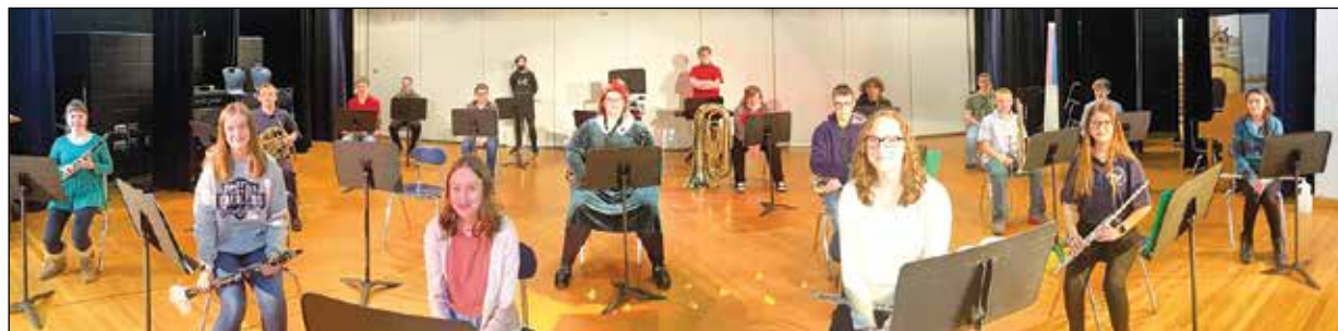
Eighth grade band performed “live” during the sixth grade lunch periods and presented an audio concert to the families of the performers.