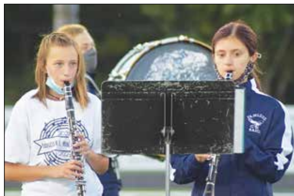
Marching Band held its first ever “Rock Brideweser” event. We featured the eighth grade band members, and recognized the achievements of several band members.