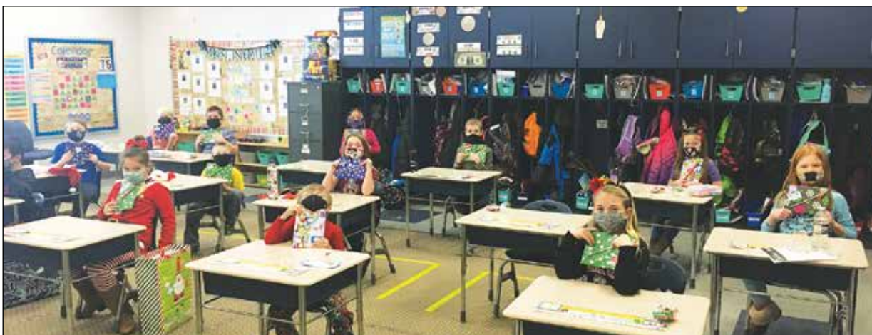
Some second graders were very excited to get chapter books for Christmas. We love to read in second grade!

Third graders learned all about the different states of matter. They participated in five different demonstrations/experiments to better understand the nature of solids, liquids, and gases. We made a big mess but had so much fun!