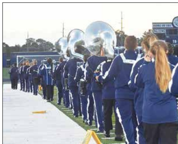
Marching Band performed at all home football games, donning a new tracksuit.

Although this school year has looked remarkably different, the Pride, Tradition and Spirit of Fairless remains strong. Here are just a few of the highlights: