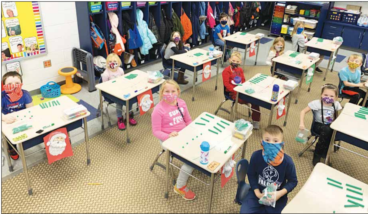
First graders have been busy learning about place value. They are having fun using base ten blocks at their desks.