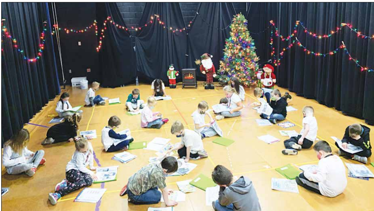
First graders practicing their reading skills by the fireplace during Right to Read Week!