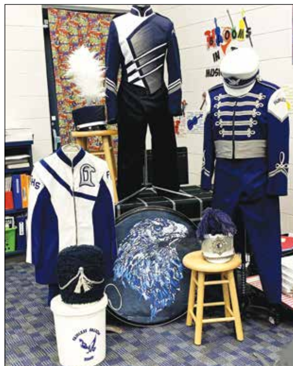
After nearly 20 years of fundraising, the marching band received new uniforms. The uniforms take details from the previous two uniforms for a sleek look.