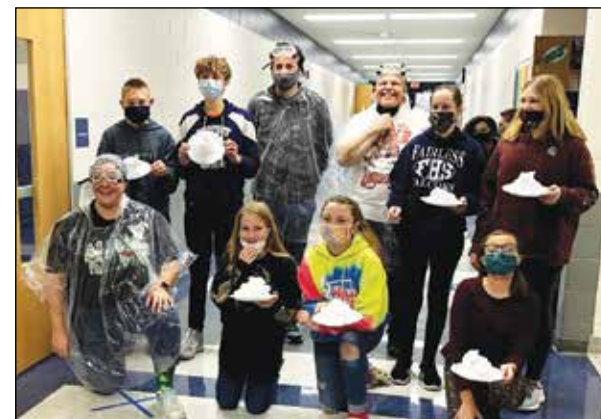
With your help, the music department sold over 700 Troyer Pies in our annual sale. The students who sold more than 25 pies had the opportunity to “pie a director” in the face.