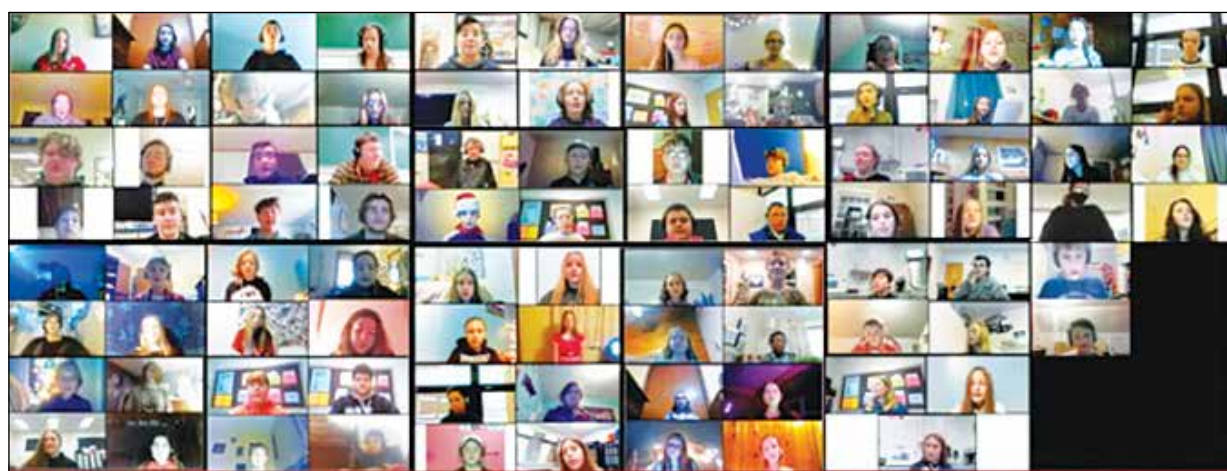
After over 100 hours of video editing, the 6-12 choirs presented a combined virtual performance of “Let Heaven and Nature Sing”. You can see the video by visiting: https://youtu.be/NSu3fso8iuc .