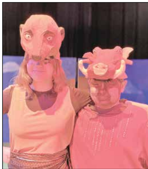
Timon and Pumbaa