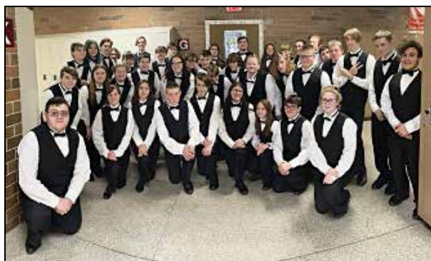
The Falcon Concert Band performed at the OMEA Ohio Competition.