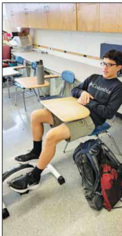
Fairless Aultman Ambassadors received an AAP HS grant to purchase under-the-desk cycles to promote movement in classrooms.