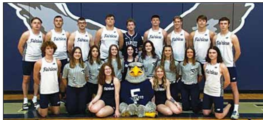
Spring Sports Seniors