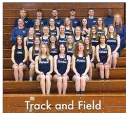
Girls' Track and Field