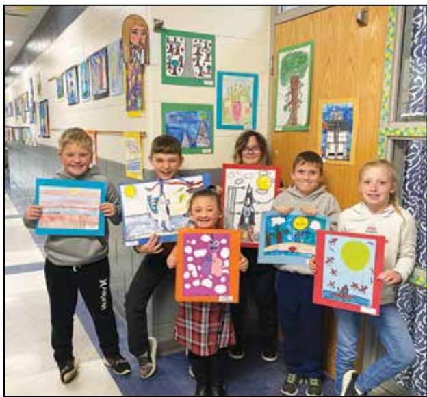
Some of the fourth-grade students show off their artwork.