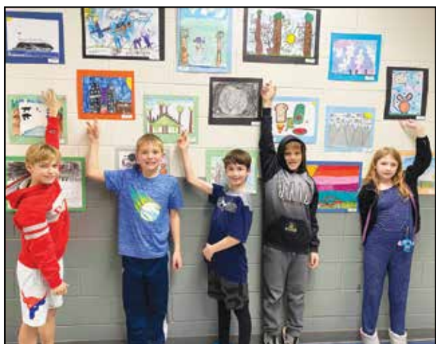
Fourth-graders take pride in showing their artwork that was displayed in the annual art show.