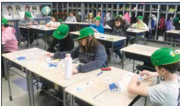
Fifth graders studying for state testing.