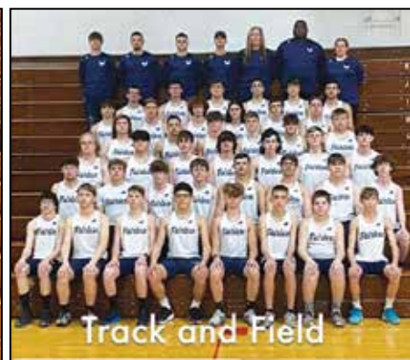
Boys' Track and Field