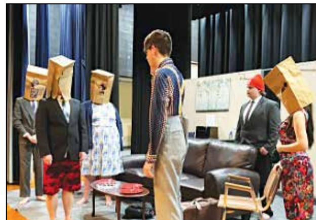
Falcon Playhouse puts on two performances: "Steel Magnolias" and "The Nerd."