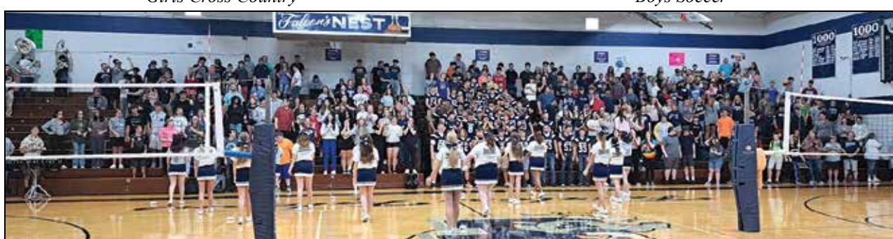
First Pep Rally