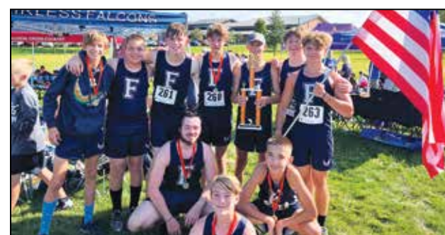
Boys Cross Country