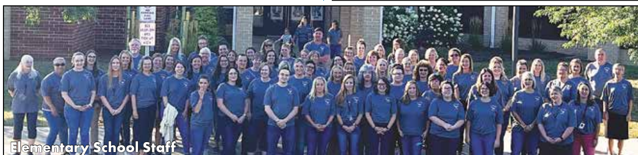
Elementary School Staff