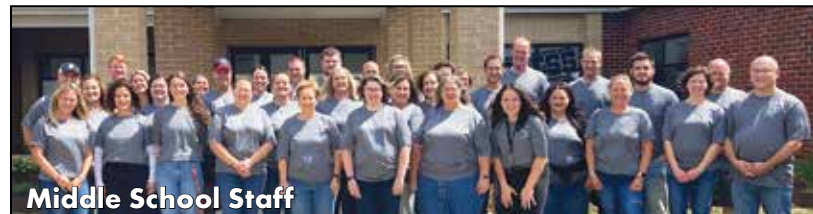
Middle School Staff