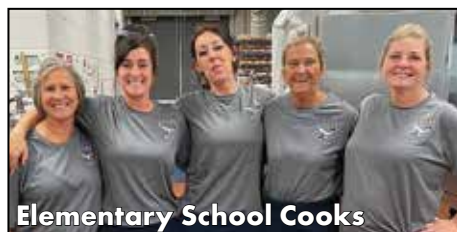
Elementary School Cooks