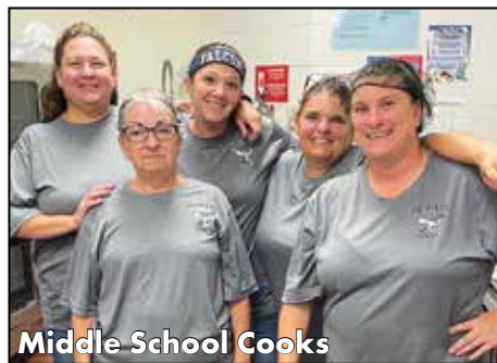
Middle School Cooks