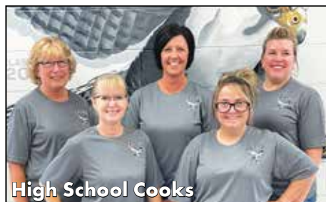
High School Cooks