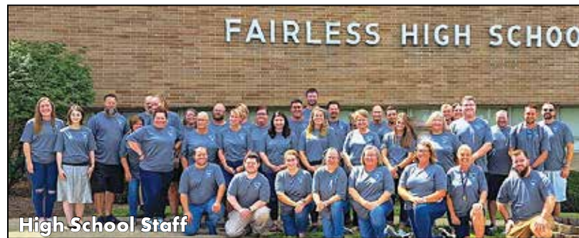
High School Staff