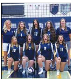
Junior Varsity Volleyball