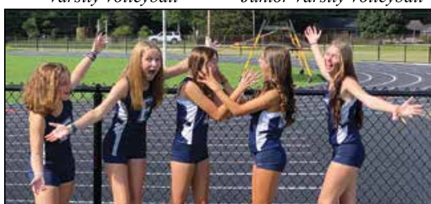
Girls Cross Country