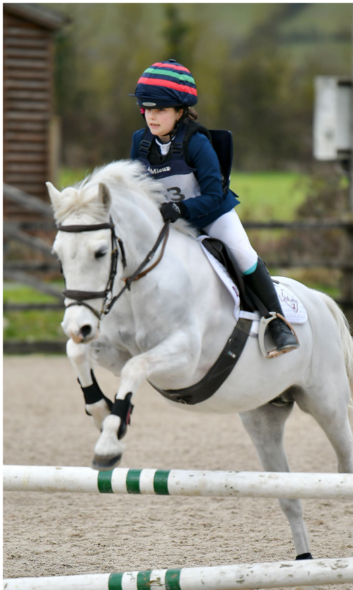
Wednesday afternoon riders having had a super jumping session. Well done.