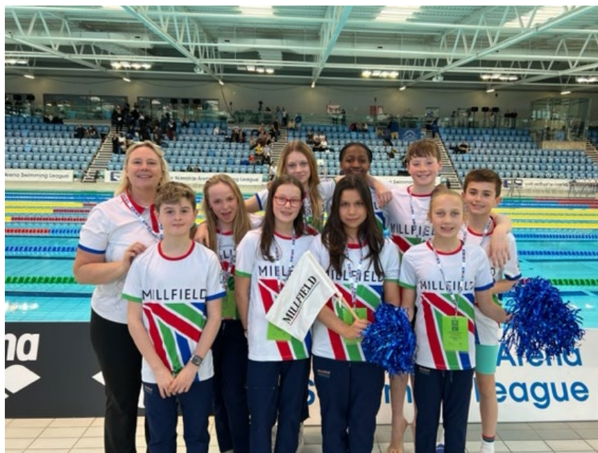
The Millfield team!