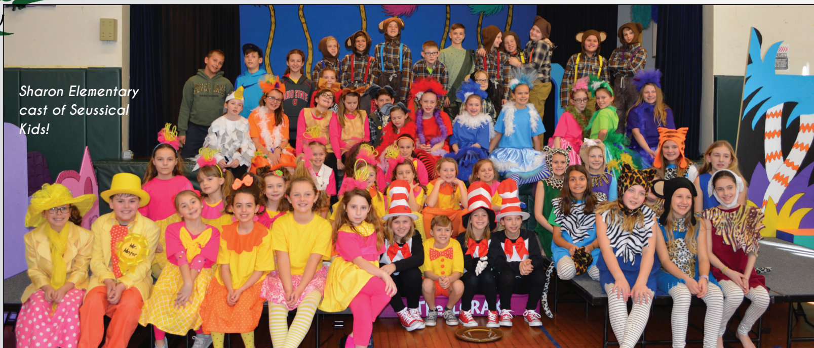
Sharon Elementary cast of Seussical Kids!