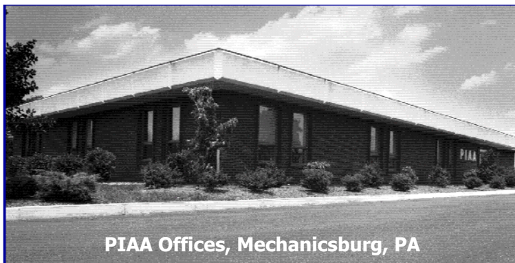
PIAA Offices, Mechanicsburg, PA

The membership of PIAA consists of more than 1,450 schools, divided almost equally between senior high schools and junior high/middle schools. Of that membership, approximately 200 are private schools. Nearly 350,000 students participate in interscholastic athletics at all levels (varsity, junior varsity, or otherwise) of competition under PIAA jurisdiction, which placed Pennsylvania seventh among the states for 2006-2007. Similar associations exist in all 50 states.