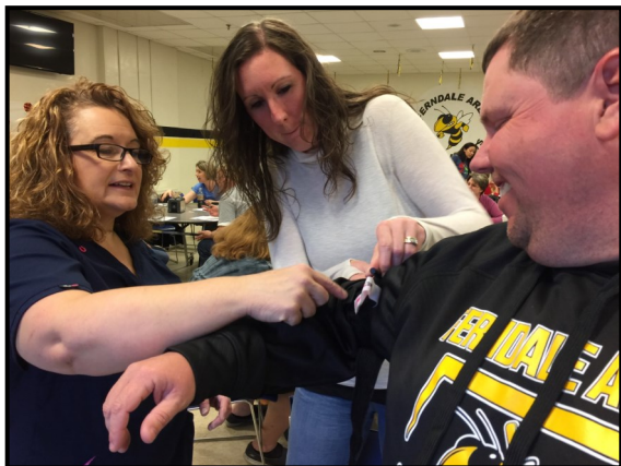
Teachers practice skills learned in the Stop the Bleed refresher provided by Conemaugh Memorial Hospital.