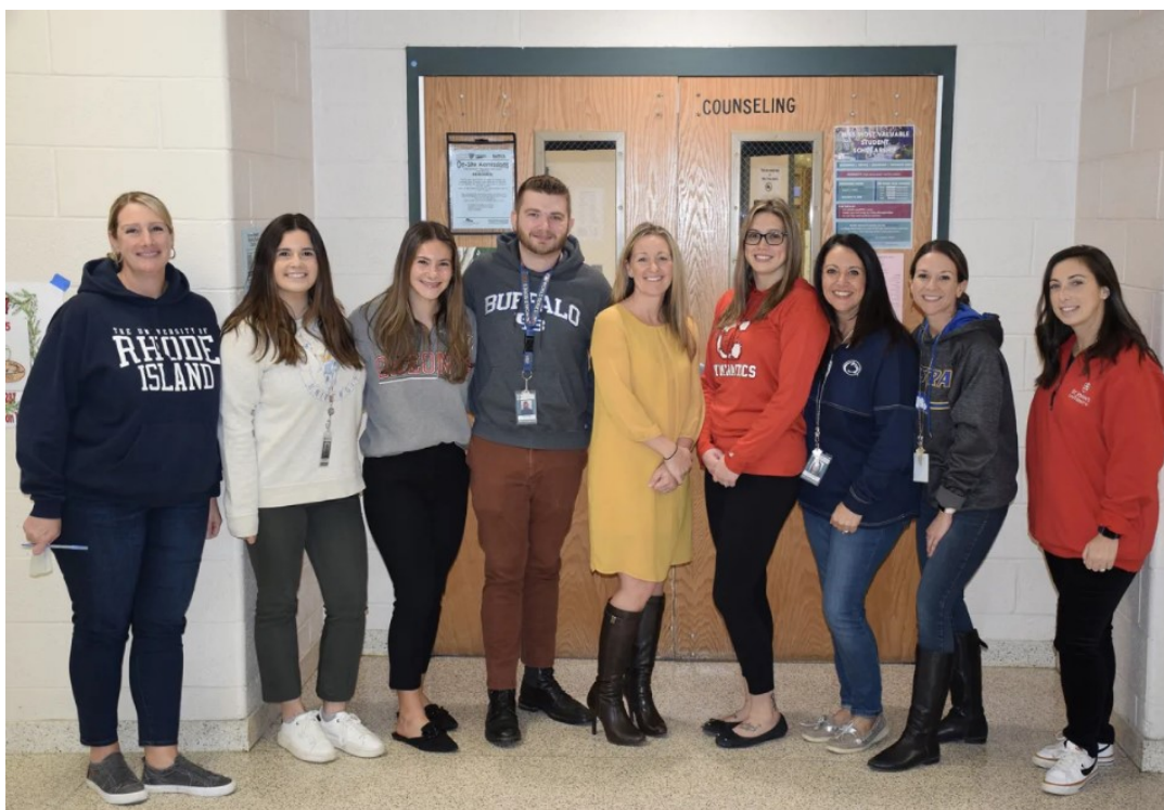
Pictured above, some of the counselors during On-Site!