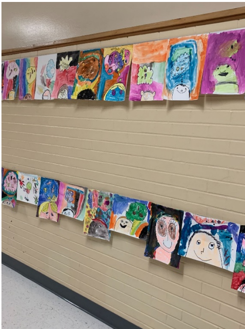
CES/DCS students brighten up the hallways with positive messages colored in art class!