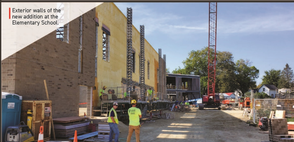
Exterior walls of the new addition at the Elementary School.