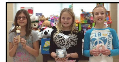
Fifth Grade students collected Toys for Tots for area children.

COLUMBUS SCHOOL DISTRICT IS AN EQUAL OPPORTUNITY EMPLOYER.