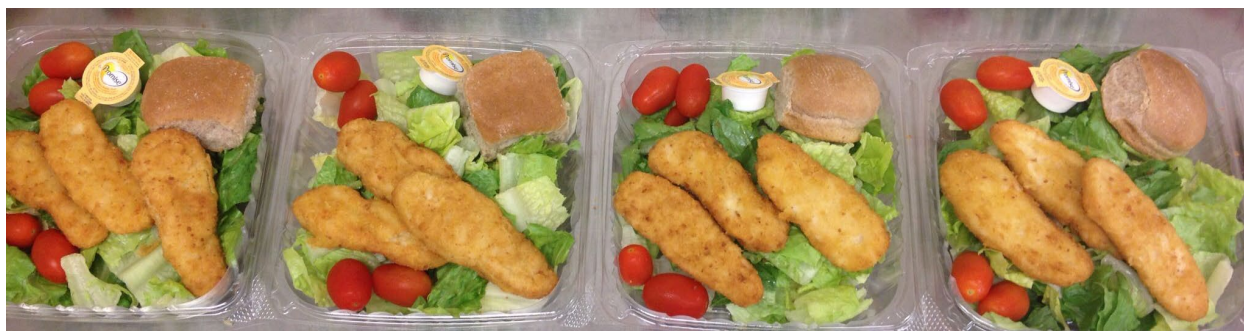
Sample photo of a crispy chicken entrée salad