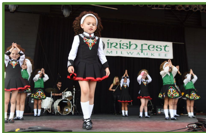
Milwaukee's Irish Fest

bread to sop up the juices in the stew. To make the milk sour, Chef Irene will add a touch of lemon juice to the milk before mixing in baking soda, salt, and flour.