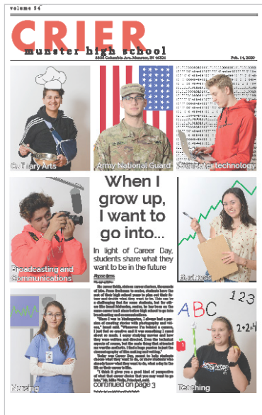
Front of Crier newspaper for career day

Help create something incredible—Crier, the monthly newspaper or Paragon, the yearbook—while earning a fine arts credit and an honors credit!