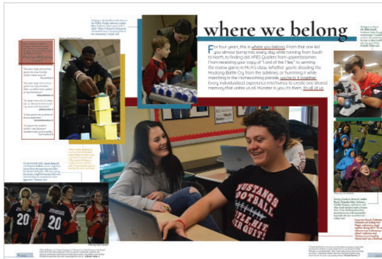
Two-page spread in 2019 Paragon

Or e-mail a student editor: Lita Cleary, current Paragon editor at 8001229@student.munster.us Reena Alsakaji, current Crier editor, at 9002059@student.munster.us