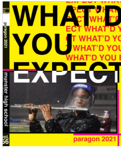
2021 Paragon yearbook cover