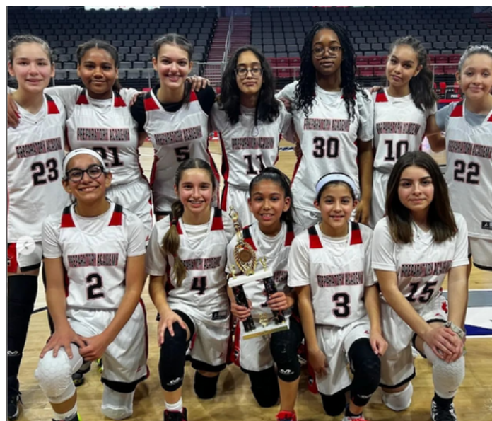
Girls Spartan basketball team celebrates their Regional Championship title.