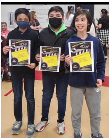
Winners of the Anti-Vaping Video contest.

Also, on the schedule at the pep rally were the Pep Rally dance squad and drumline. Both groups led the way to rally the crowd and keep everyone pumped up.