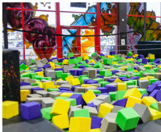
Helium Trampoline Park in McAllen, Tx