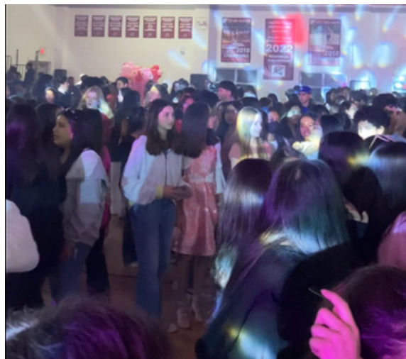
Preparatory Academy students enjoy the DJ's music at the Valentine's Dance.

The Valentine's holiday has been a controversial topic for a while, and people have no idea whether they should consider it a holiday at all. Saint Valentine's Day originated as a Christian feast day that honored Valentine who was martyred in the year 269, I know right, quite a while ago I mean we're talking century ago.