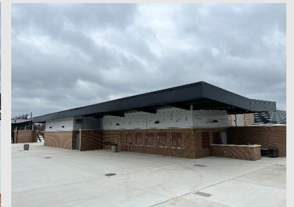
Groves – New Concession Building