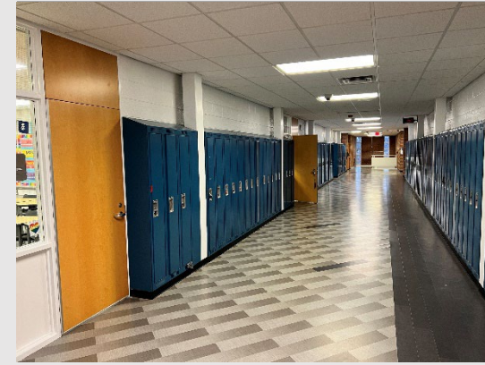
Berkshire – Door Replacements