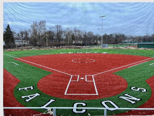
Groves – Varsity Softball Field