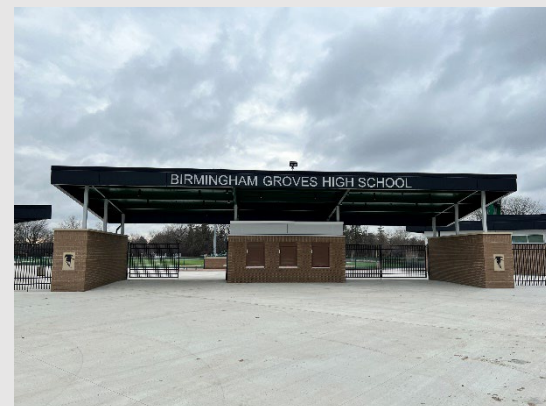
Groves – New Stadium Entrance