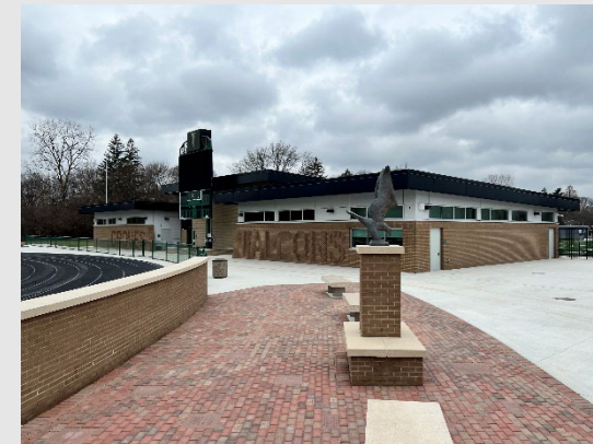
Seaholm – New Teams Building