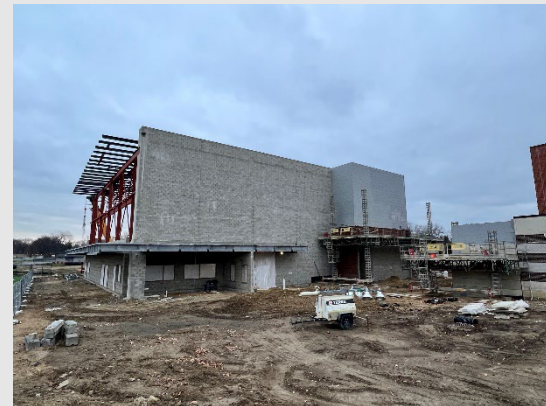
Seaholm – New Auxiliary Gym