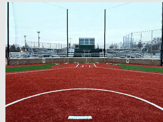
Groves – Varsity Softball Field