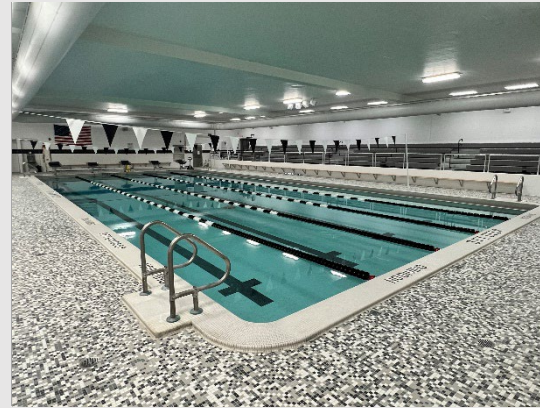
Berkshire – Pool Improvements