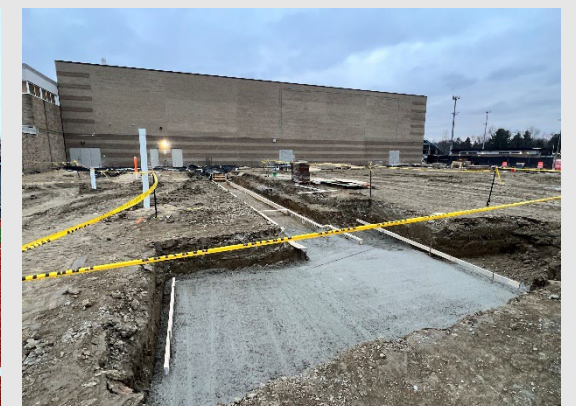
Groves – New Auxiliary Gym