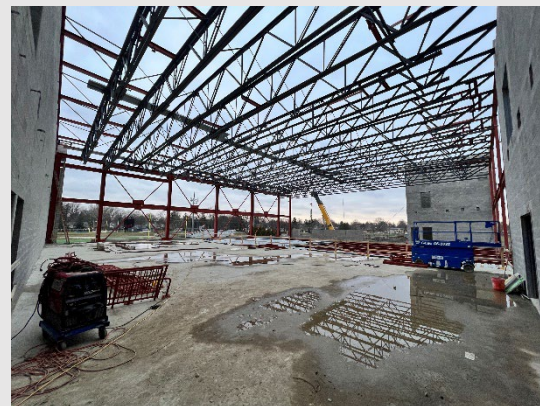
Seaholm – New Auxiliary Gym