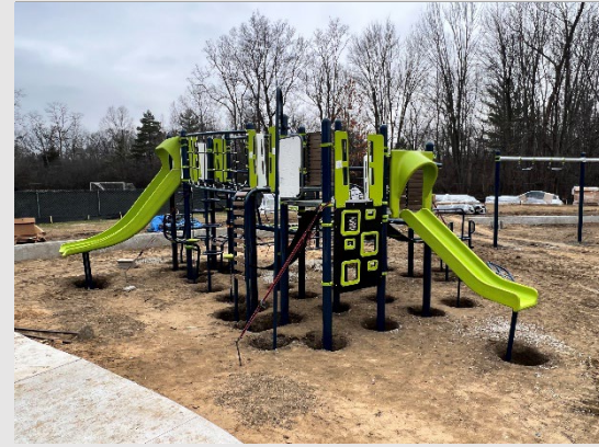
Bingham Farms – New Playground