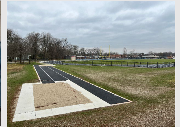
Seaholm – Track & Long Jump