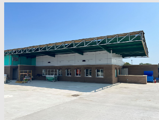
Groves – New Concession Building