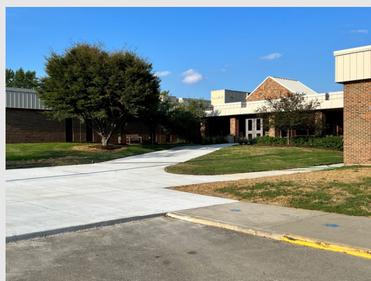
West Maple – Entrance & Vestibule