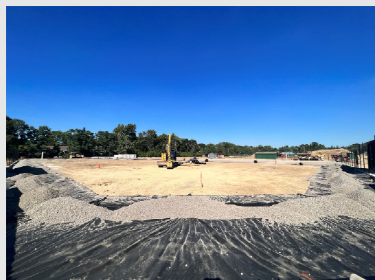
Groves – Varsity Softball Field