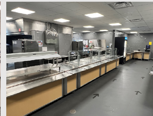
Berkshire – Kitchen Remodel