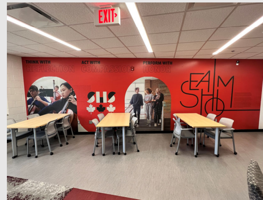
Seaholm - Counseling Graphic