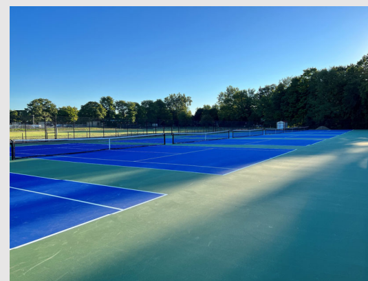
Seaholm – New Tennis Courts