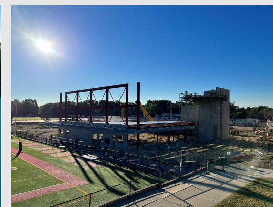
Seaholm – New Auxiliary Gym