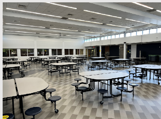
Berkshire – Cafeteria Remodel