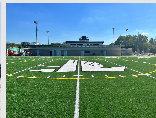
Groves – New Practice Field