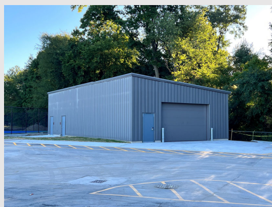
Seaholm – New Maintenance Bldg.