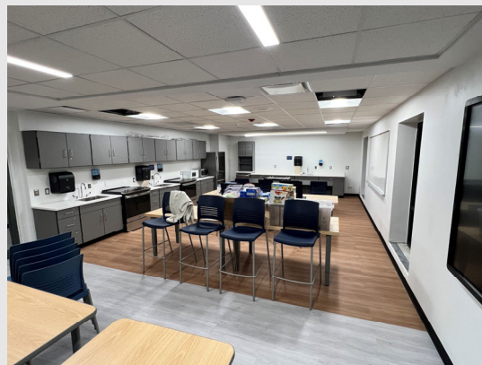
BATP – Community Room