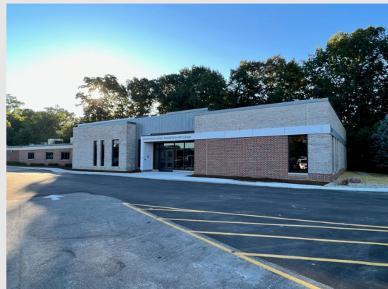
BATP – New Addition