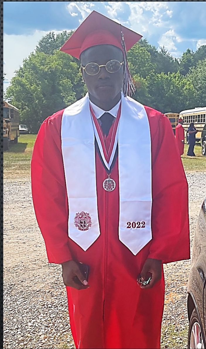
His symbolic walk in Alabama.