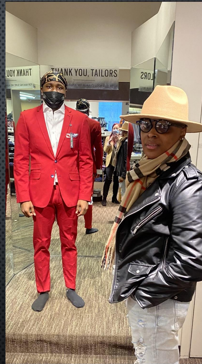
STEILLY RED CUSTOM SUIT FOR HIS OFFICIAL WALK AT SHS .