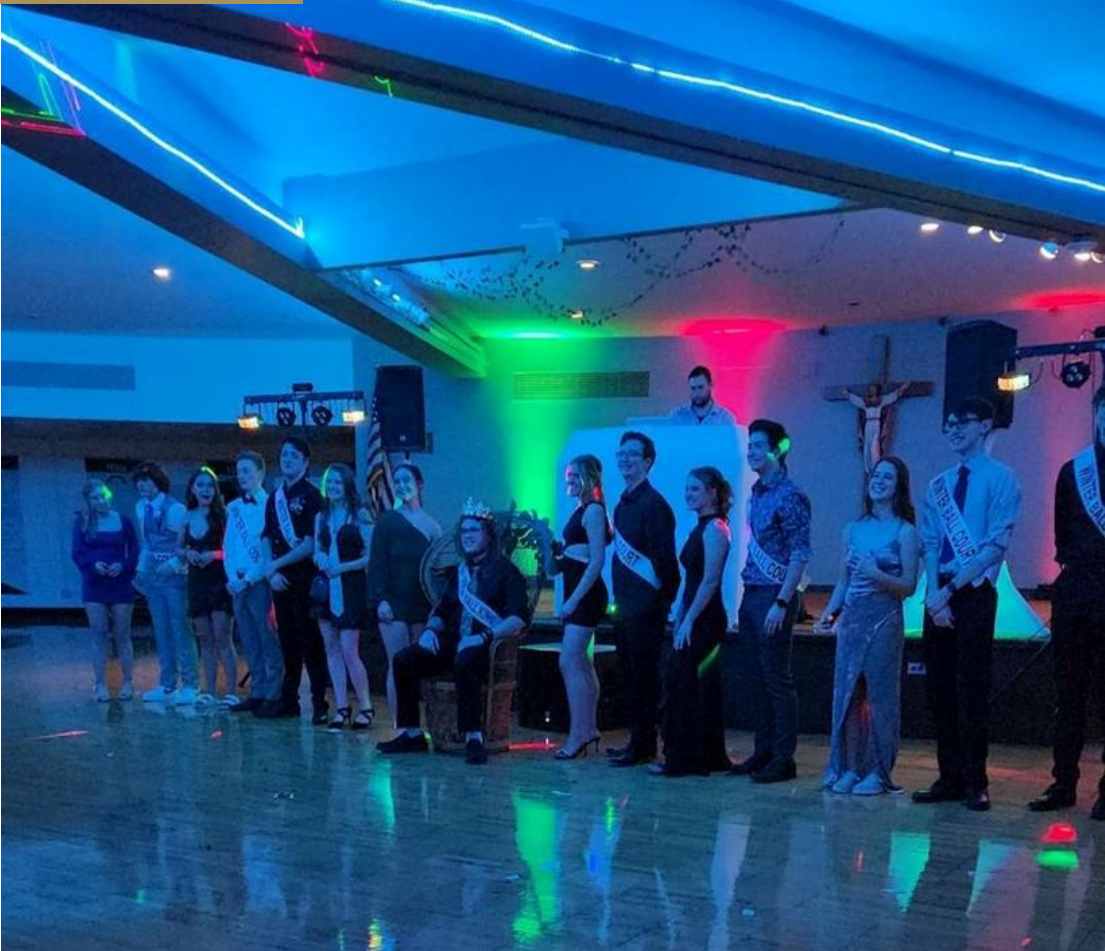
Above, you can photos of this year's winter ball court!