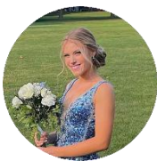
Compiled By: Lucy Mast