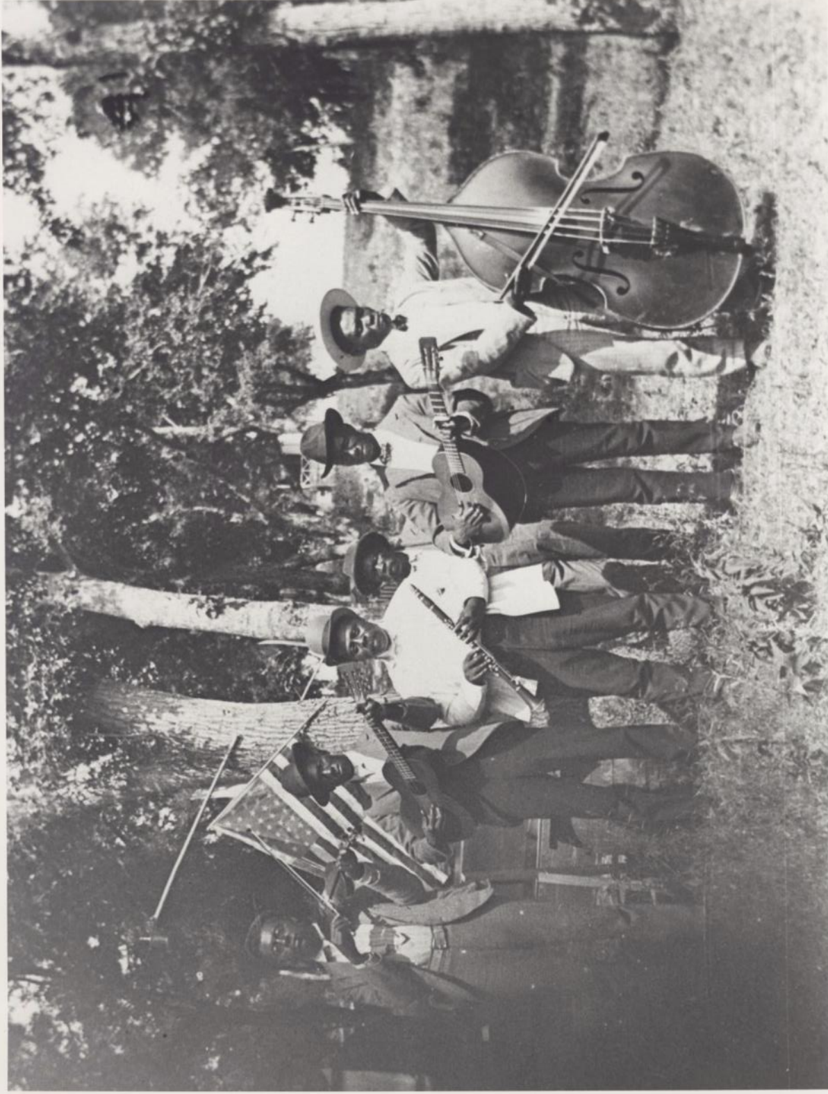
Primary Source H: Juneteenth Day Celebration band, June 19, 1900, Texas