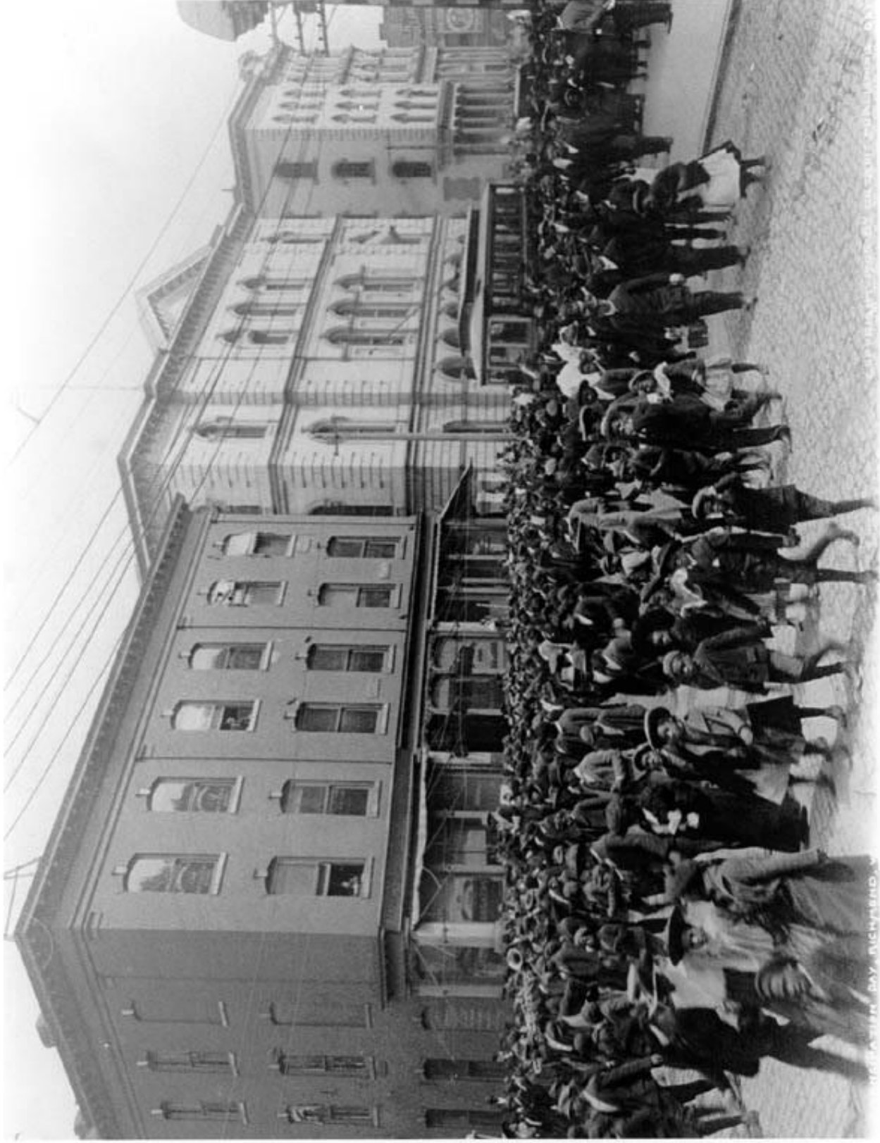
Primary Source G: Emancipation Day celebration in Richmond, Virginia, in 1905