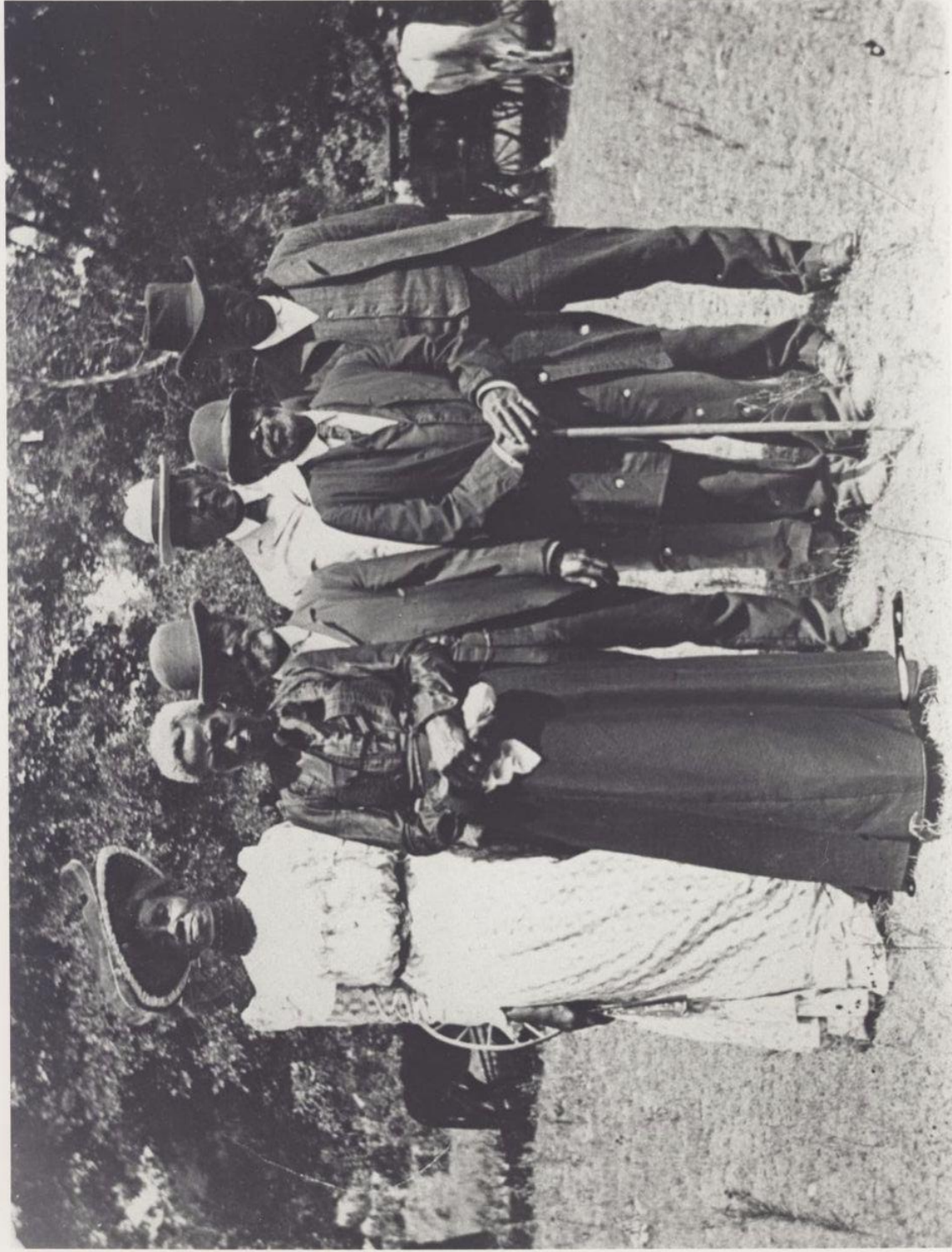
Primary Source F: Juneteenth Emancipation Day Celebration, June 19, 1900, Texas