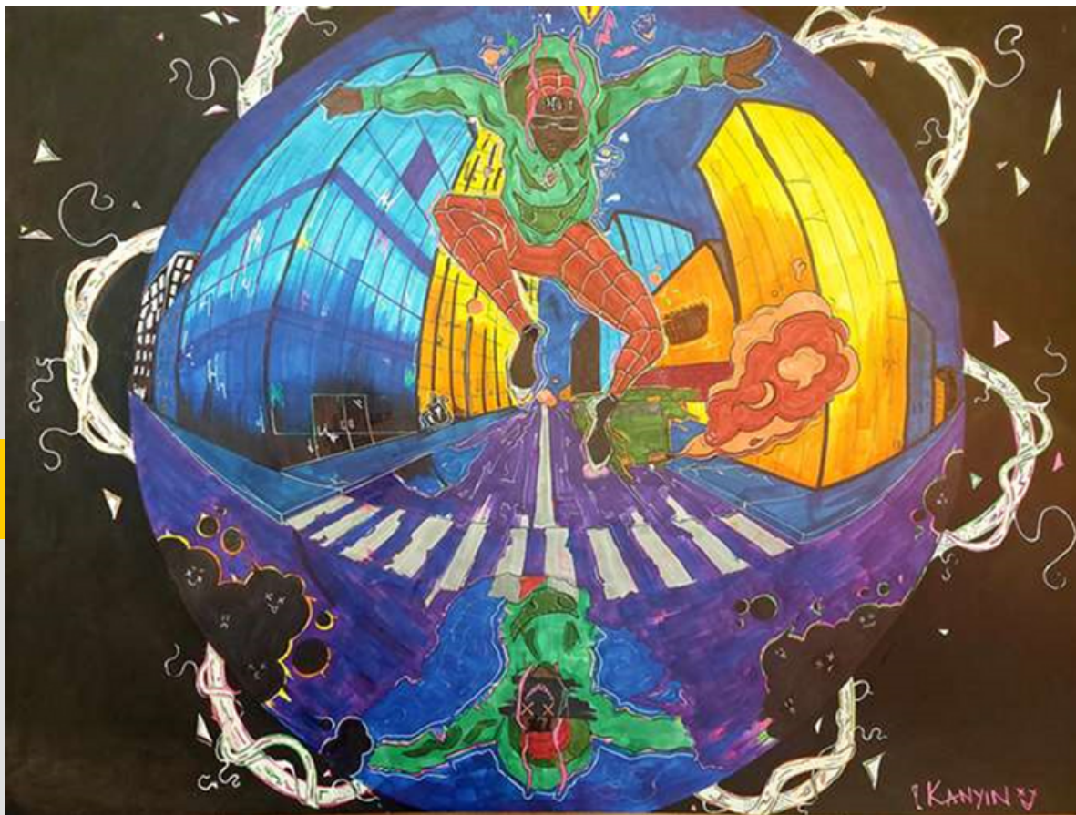
Kaynin Tokan-Lawal | Honorable Mention ^ Silver Key