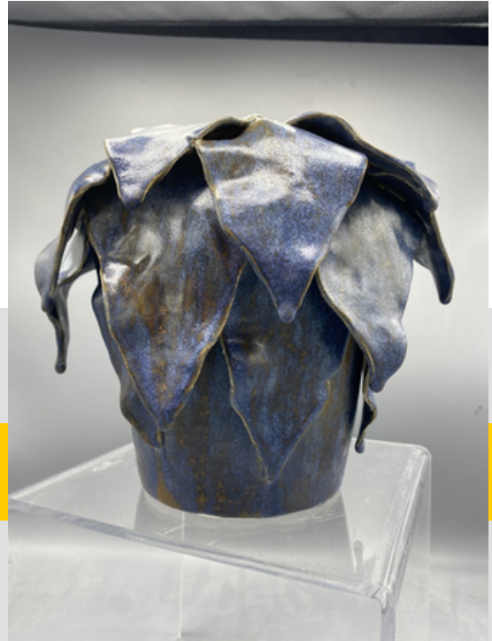
Kaitelyn French | Silver Key