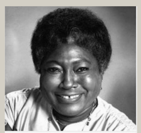
Attended Yale University.

Became the first woman to receive the NAACP Chairman's Civil Rights Leadership Award for helping raise the image of blacks.