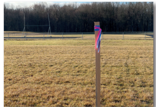
The beginning phases have begun as Robertson Construction staked the area around the track for the new stadium.

One more step toward becoming a reality, the land has been surveyed and staked for the stadium project. The Athletic Boosters are working hard to meet the $2 million goal while the school financials should be in place in April. Biweekly meetings are being held for design and development discussions with a groundbreaking ceremony planned for late spring. We greatly appreciate all of the community support and look forward to a facility that will be used by all Northridge athletes, students and community members. Haven't made your donation to the project yet? Scan the QR code to donate today! ☺