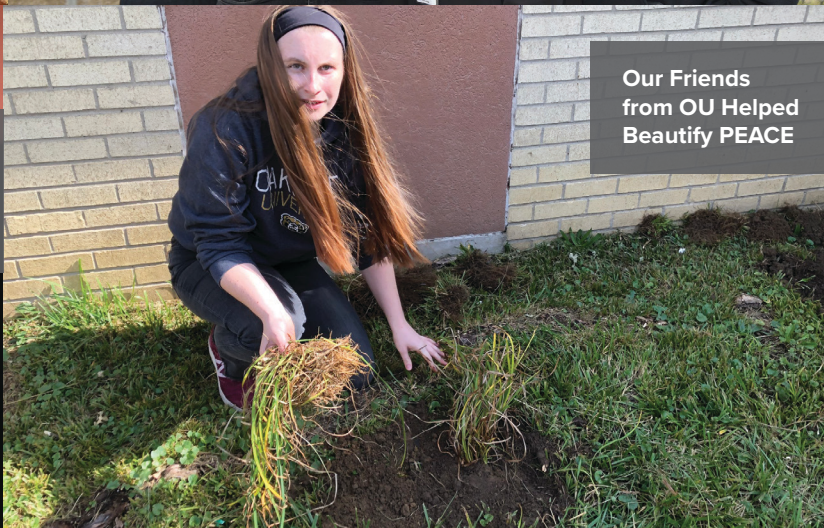
Our Friends from OU Helped Beautify PEACE