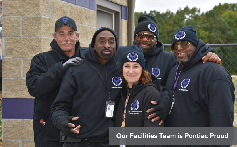
Our Facilities Team is Pontiac Proud