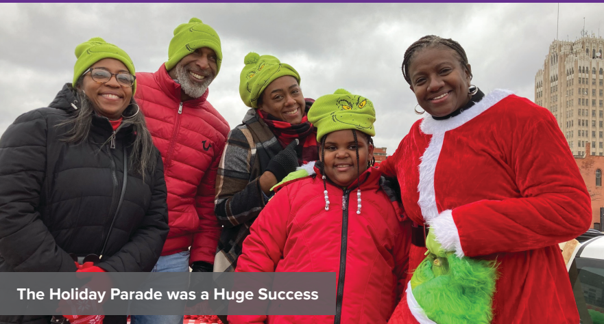
The Holiday Parade was a Huge Success