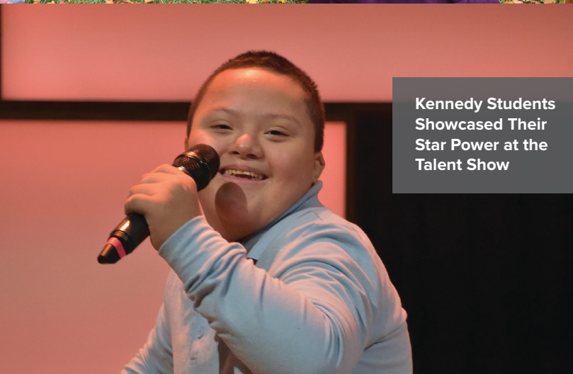
Kennedy Students Showcased Their Star Power at the Talent Show