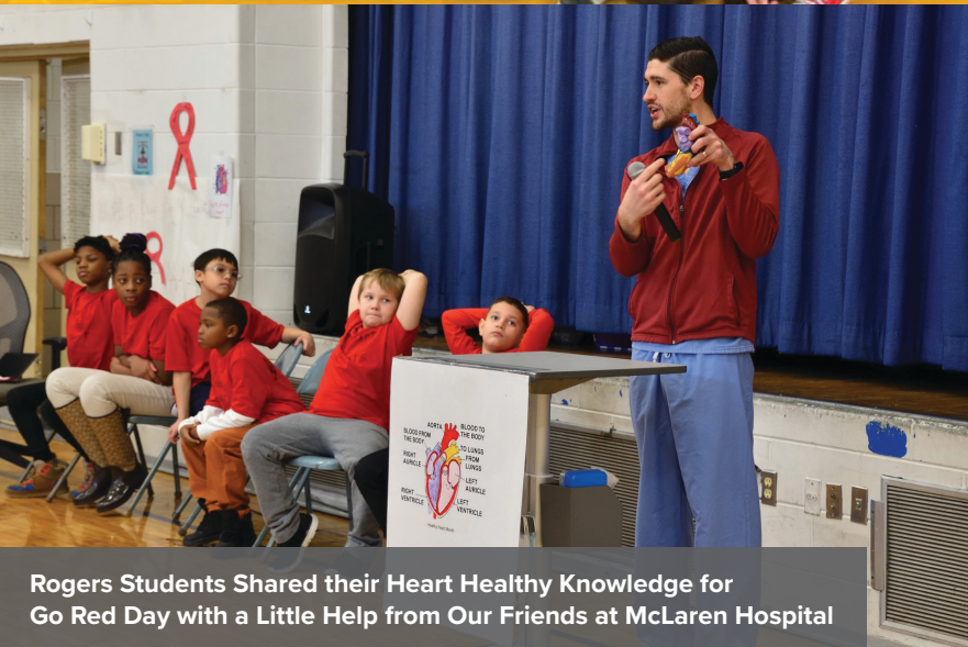
Rogers Students Shared their Heart Healthy Knowledge for Go Red Day with a Little Help from Our Friends at McLaren Hospital