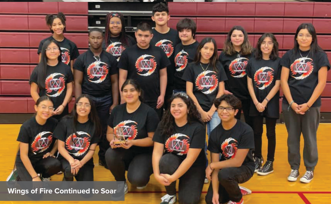
Wings of Fire Continued to Soar