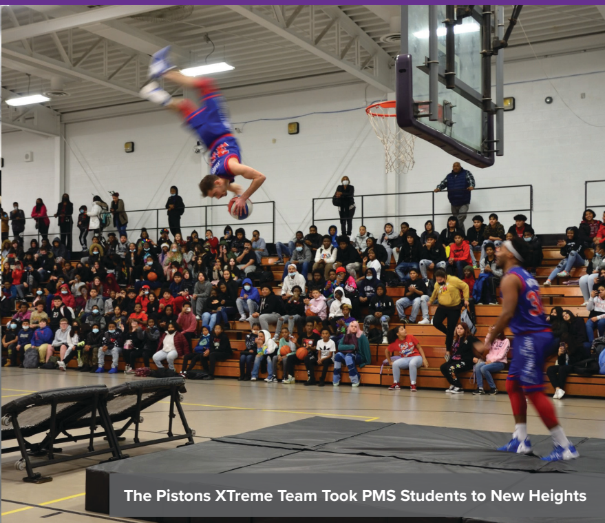
The Pistons XTreme Team Took PMS Students to New Heights