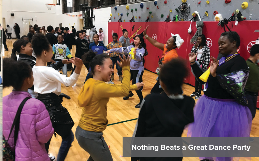
Nothing Beats a Great Dance Party