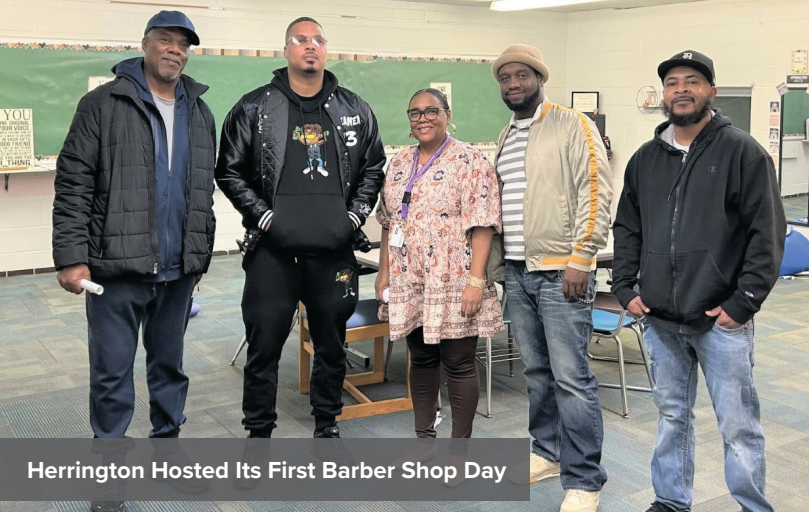
Herrington Hosted Its First Barber Shop Day