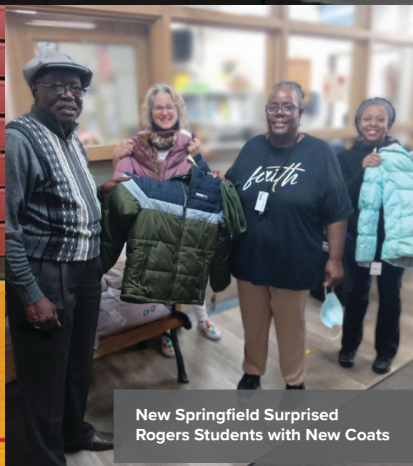
New Springfield Surprised Rogers Students with New Coats