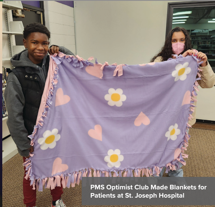
PMS Optimist Club Made Blankets for Patients at St. Joseph Hospital