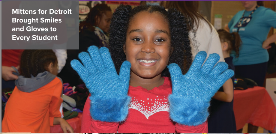
Mittens for Detroit Brought Smiles and Gloves to Every Student