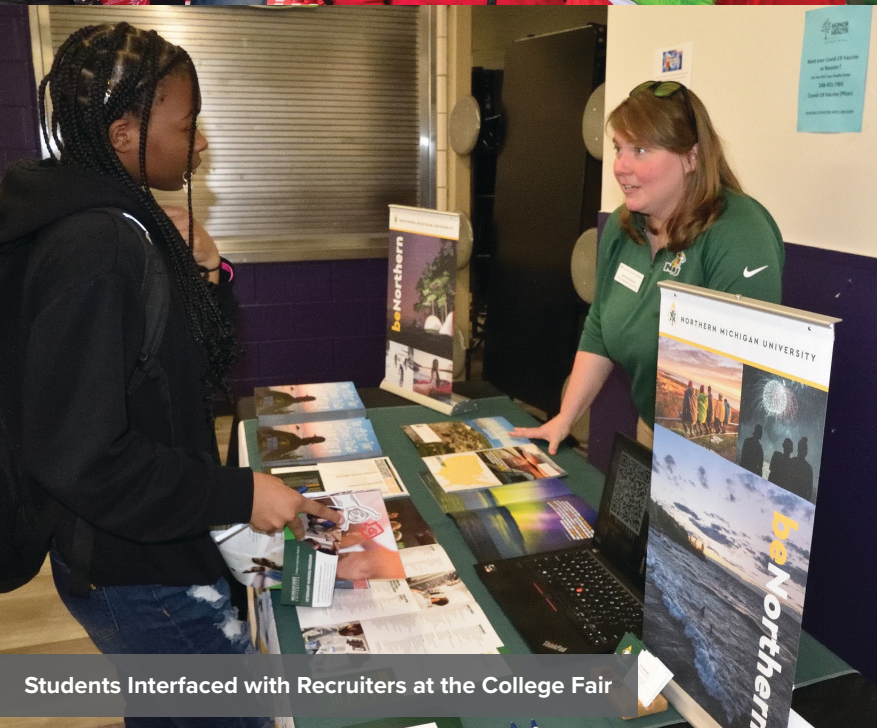
Students Interfaced with Recruiters at the College Fair