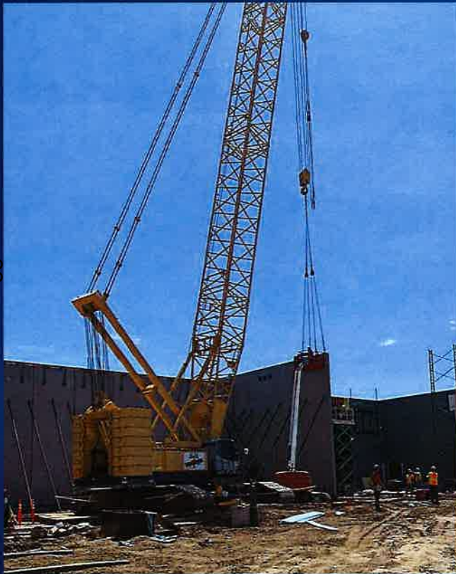
Storm Shelter Erection