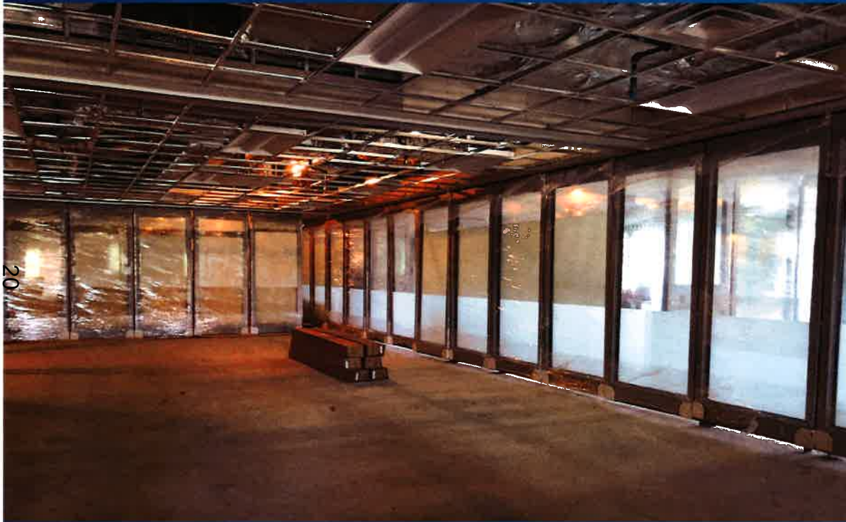
Learning Den Flexible Classroom Space