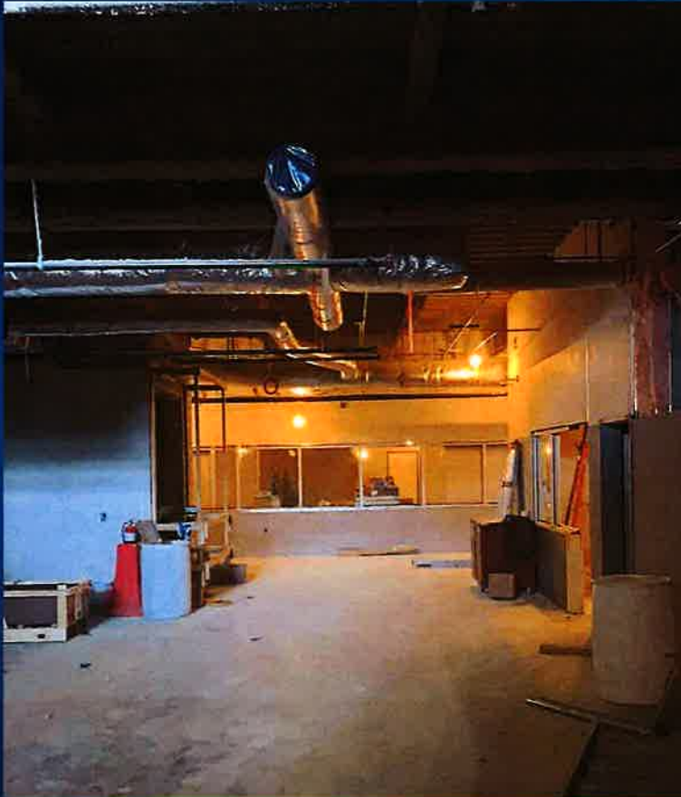
Teacher Station and Lower Level Learning Den