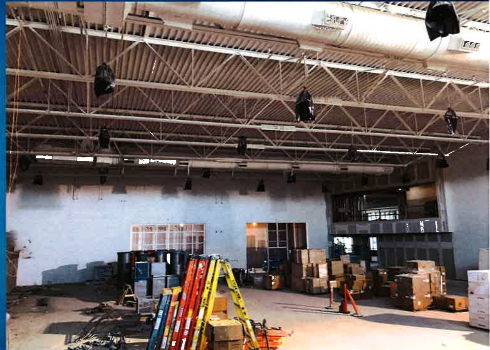
Competition gym interior.