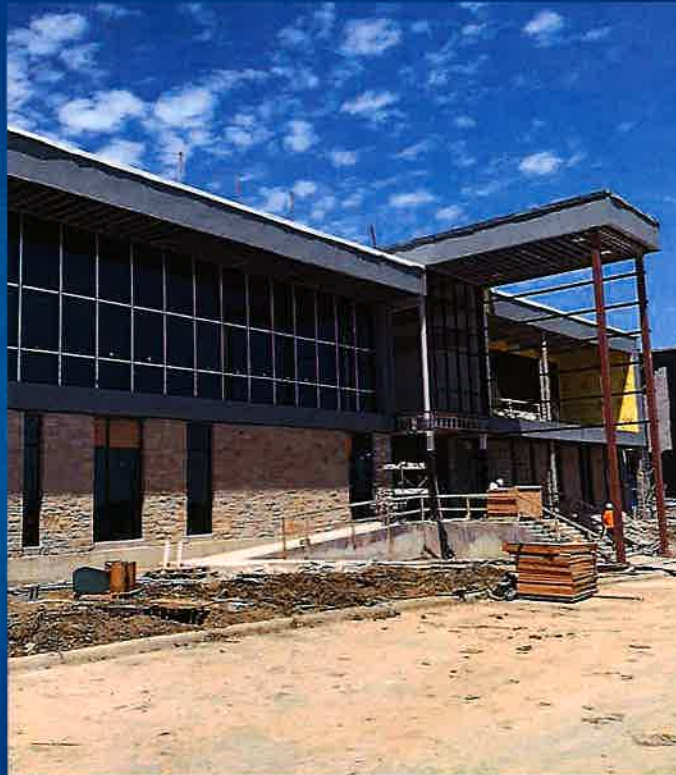
Main Entrance & Ramp