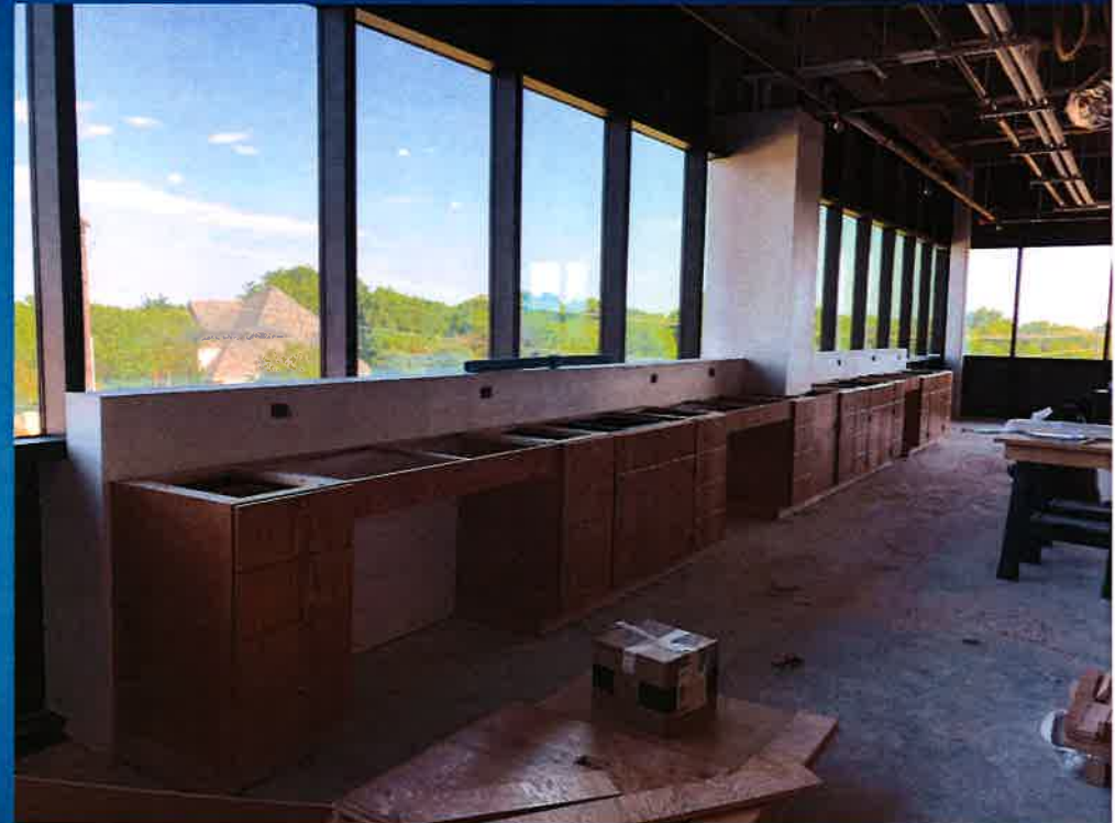
One of nine Science Labs with Millwork installations in progress