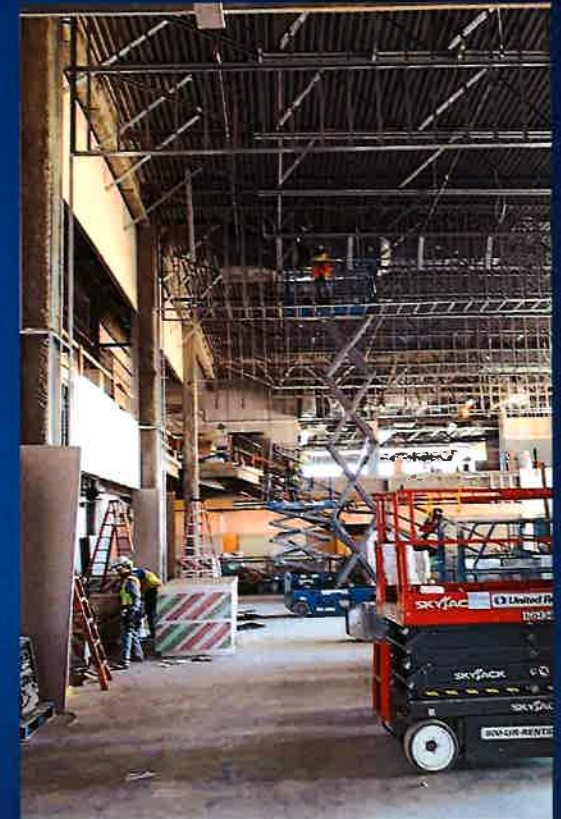
Atrium Ceiling Closure