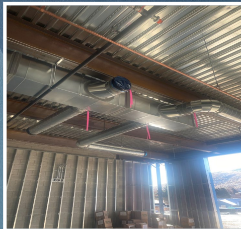
L1 Ductwork Install