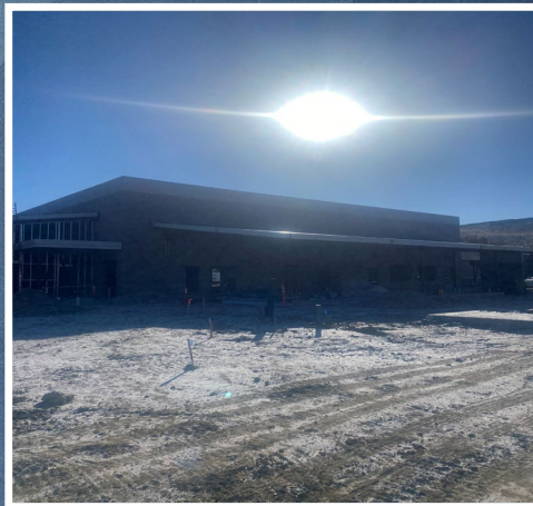
North Admin Area