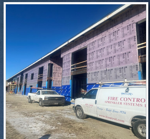
Southside Rigid Install