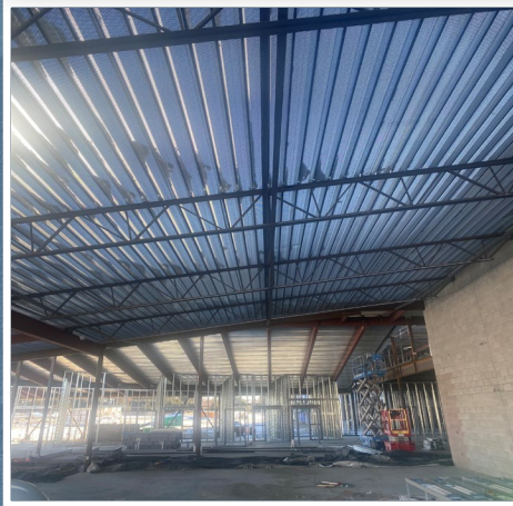
Admin Area Interior