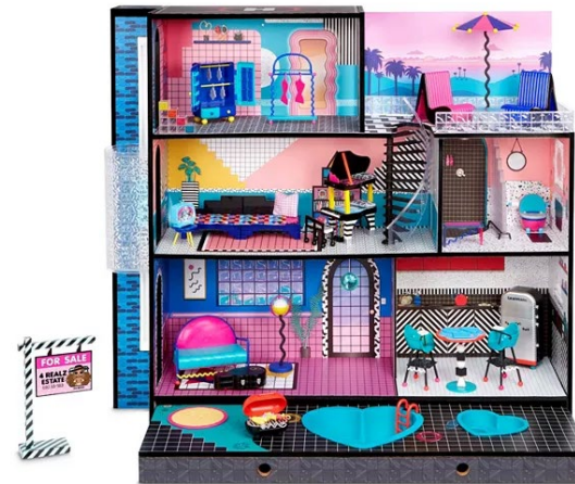
LOL Surprise! Real Wood House w/ New Family