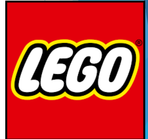
$200 Gift Card to Lego Store