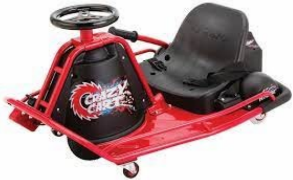
Razor Crazy Cart

*We will have 1 top pledge winner for grades K - 2 and for 3 - 5!*