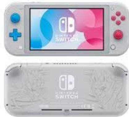
Nintendo Switch Lite