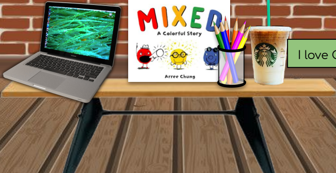
I love Coffee!