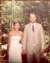
Me & My Husband