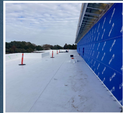
TPO & Parapet