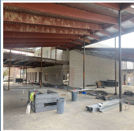
L1 Admin Area