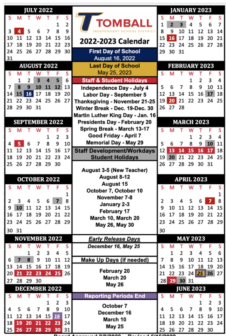
Board Approved 2/8/2022 -- Revised 6/16/2022