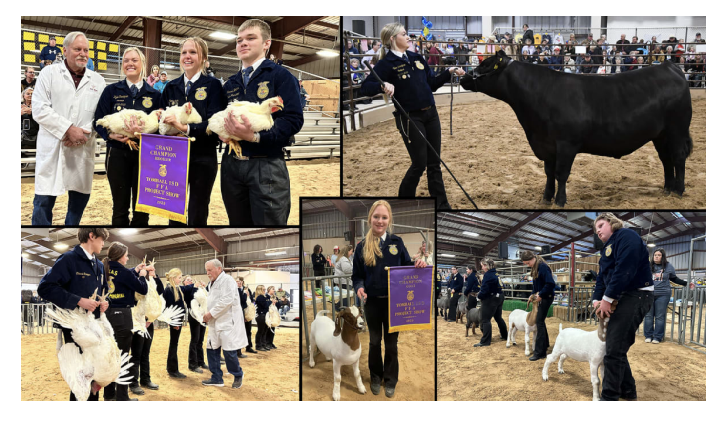
Tomball ISD FFA students from Tomball High School and Tomball Memorial High School showcased their hard work and commitment to the FFA program by participating in the 47th Annual FFA Project Show in January.