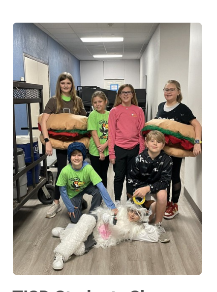
TISD Students Showcase Talents at Destination Imagination Regional Tournament