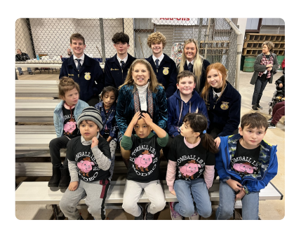
Tomball ISD Hosted Special Rodeo