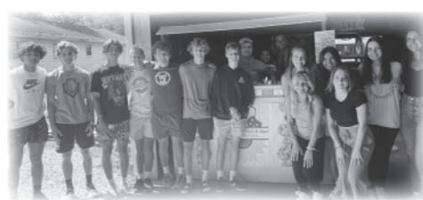
Service Learning Class Visited Du-Mor Farm