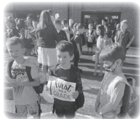
Craddock School 1st Day of School