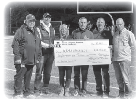
Aurora All Sports Boosters Board (four on right) Presented a Donation Check

The ACSD is extremely grateful to the Aurora All Sports Boosters whose Board members presented a generous check for $45,000 dollars on Friday, October 14 at AHS Veterans Stadium. The donation is to support all 21 district athletic teams.