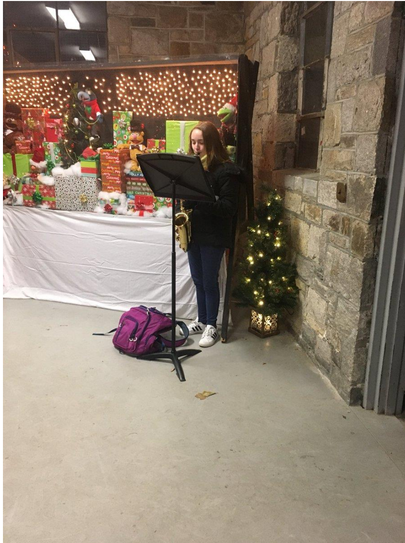
Park Avenue PTO sponsored a successful Winter Literacy Night December 2nd